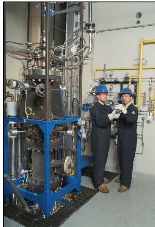
CEPG's PRESSURIZED GASIFIER