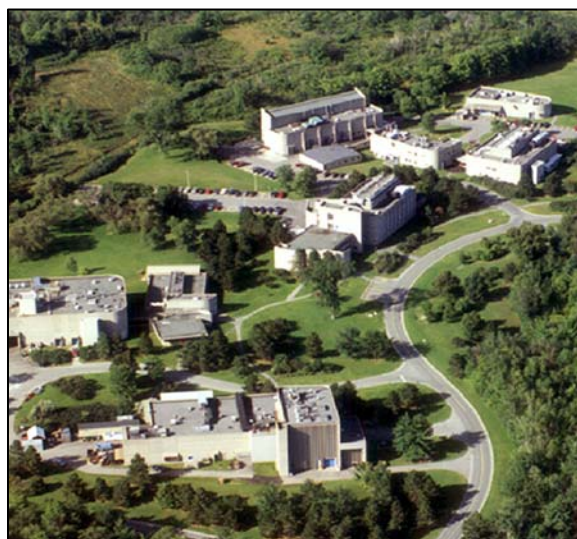
Research facilities in Bells Corners, ON