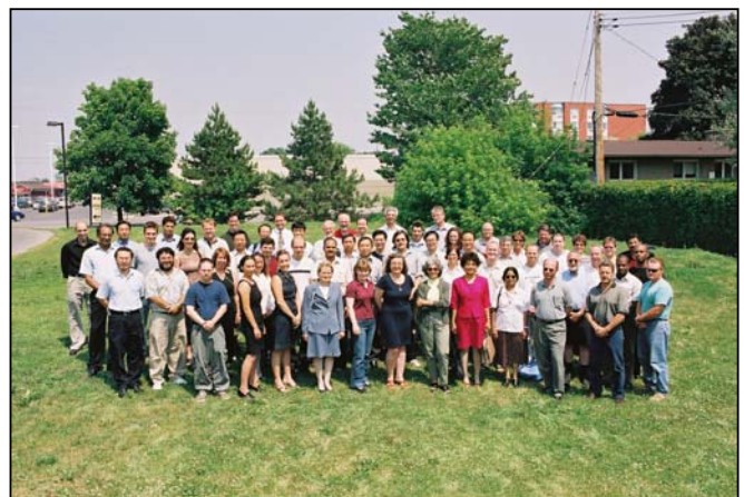
CEPG currently comprises 78 employees, mainly Research Scientists, Engineers, Technologists & Technicians, along with support staff