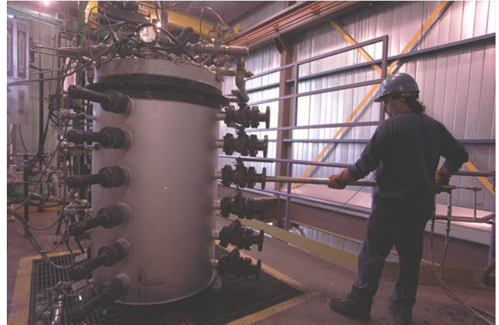
CEPG staff performing temperature measurements on the vertical combustor