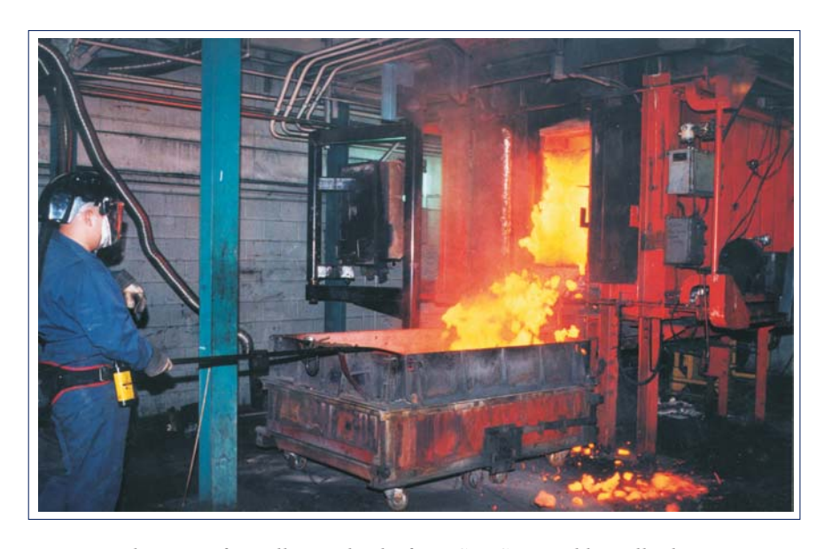
Discharging of metallurgical coke from CETC moveable-wall pilot oven

🖣 anada's coking coal trade and coke consumers rely heavily on the CANMET Energy Technology Centre's (CETC) internationally recognized test facilities for the assessment of coal and coke quality. These facilities, utilized for developing improvements in the quality of cokes by the formulation of coal blends for cokemaking, complemented by