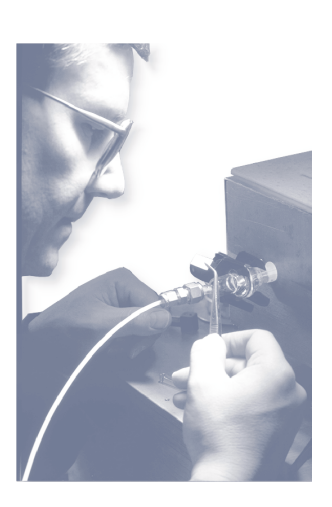
Diesel particulate analysis

CANADA'S NATURAL RESOURCES: NOW AND FOR THE FUTURE