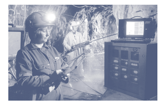
Underground at CANMET-MMSL's Experimental Mine