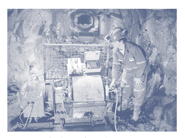
Development of automatic scraper at CANMET-MMSL Experimental Mine