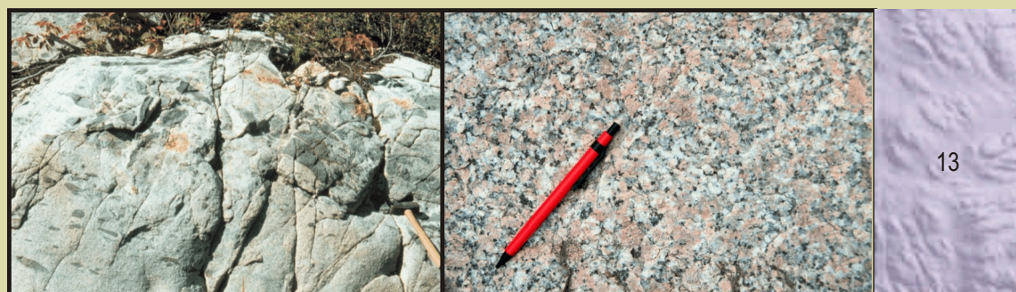
Figure 13a. Diorite with basalt fragments south of Fort Fraser. GSC 1999-035