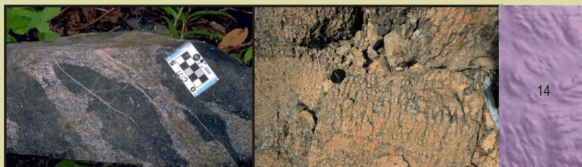
Figure 14a. Dark masses of diorite in granitic rock. GSC 1999-036