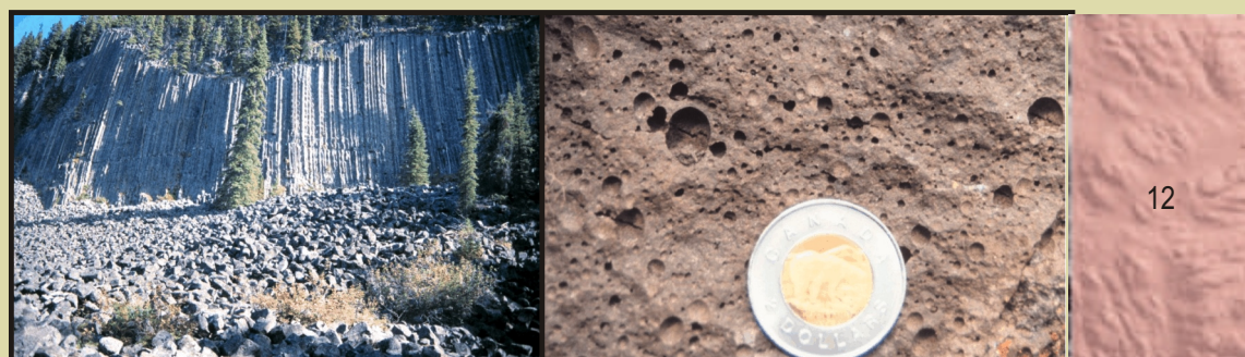
Figure 12a. Columnar jointed basalt. GSC 1999-032