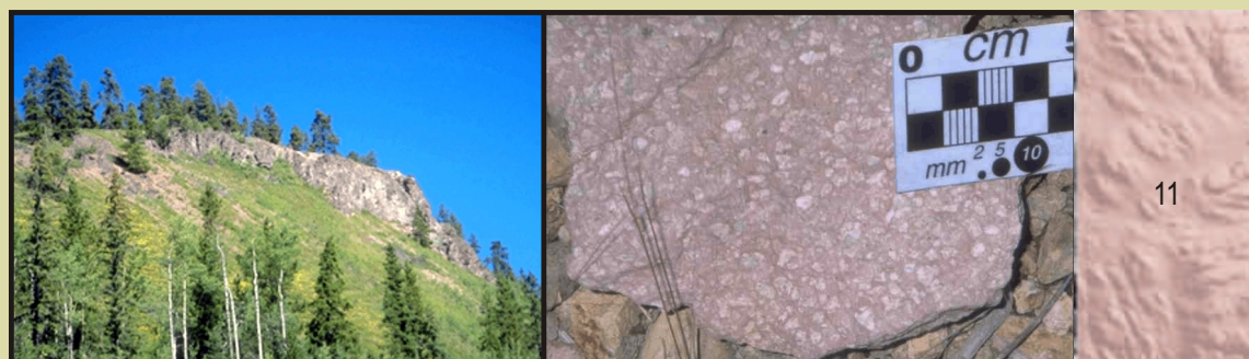
Figure 11a. Dome of felsic volcanic rock.