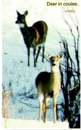
Deer in coulee.

Prairie Farm Rehabilitation Administration