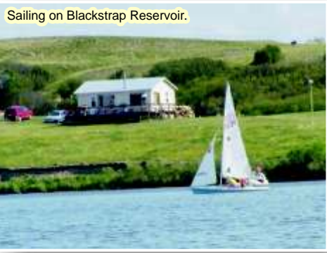
Sailing on Blackstrap Reservoir.