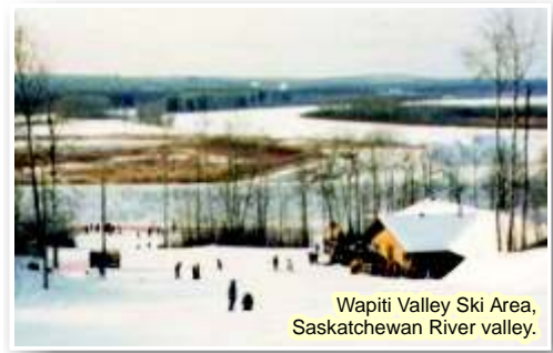
Wapiti Valley Ski Area, Saskatchewan River valley.