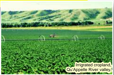
Irrigated cropland, Qu'Appelle River valley.

Large valleys, such as the Qu'Appelle and Souris river valleys, are major landscape features of vital importance to southern Saskatchewan. These valleys provide for diverse uses — water storage, farmland, wetland habitat, woodlands, gravel pits, and even ski areas. Try to imagine Saskatchewan without its valleys!