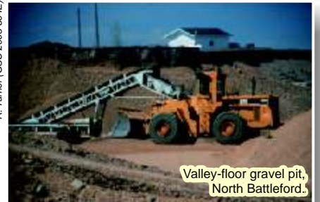
Valley-floor gravel pit, North Battleford.