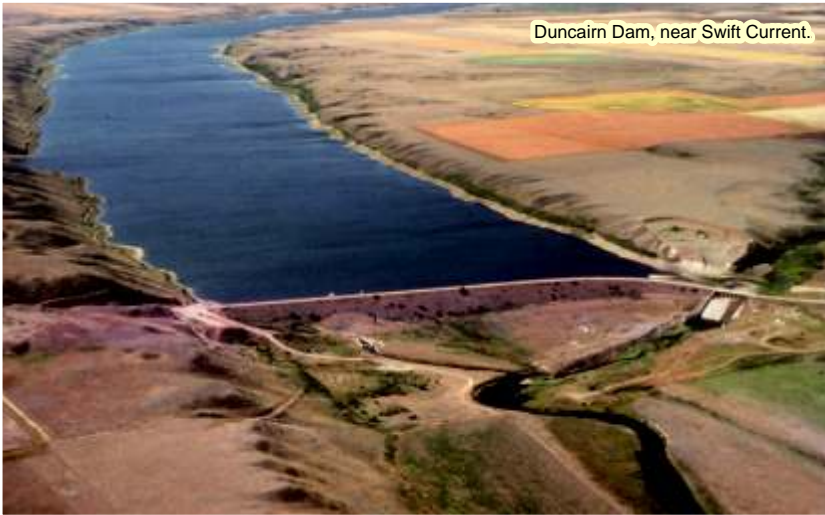
Duncairn Dam, near Swift Current.

Prairie Farm Rehabilitation Administration