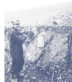
Monitoring slope stability with seismic methods