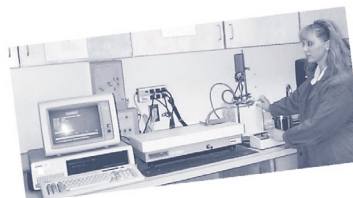
Fine particle size laser analyzers, capable of providing particle size distributions from 1 millimeter to 2 microns