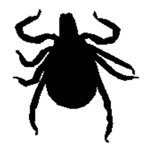
Female adult tick (approximately 10 times actual size)