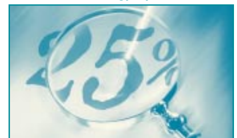
Businesses that install qualifying systems are eligible for a contribution of 25 percent of the purchase and installation costs.

Businesses that install qualifying systems are eligible for a contribution of 25 percent of the purchase and installation costs to a maximum contribution of $50 000. During the first year of REDI, NRCan received 15 applications. One application was rejected for not meeting the terms and conditions and, in two cases, the applicants decided not to proceed with the installation. Thus, 12 applications are proceeding, representing investments of $1.5 million in renewable energy systems.