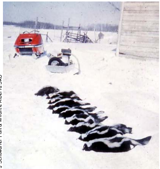
J Schwalter Fish & Wildlife Alberta SRD

As indicated above, rabies has the potential to infect humans, pets, and livestock. Although the risk of being infected is low, the consequences are high. Anyone visiting enzootic areas (areas where the virus commonly occurs) should be aware of the risk and take appropriate precautions for themselves and their pets. In addition, the costs to public health and to agricultural economics dictate that this disease be regarded as a significant concern.