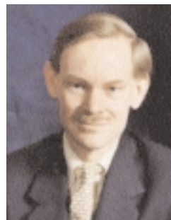
Robert B. Zoellick United States Trade Representative United States