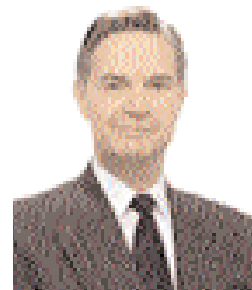
Luis Ernesto Derbez Secretary of the Economy Mexico