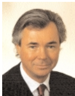
Pierre S. Pettigrew Minister for International Trade Canada