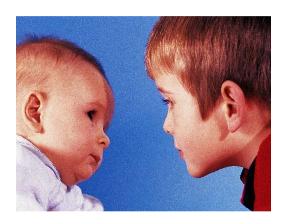
2003/04 Healthy Families Investment - $873,000