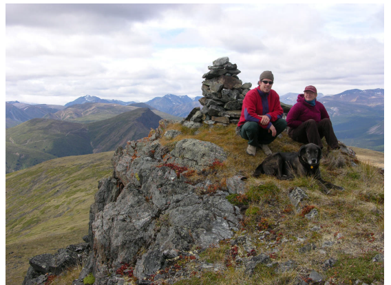
Bradshaw's Cairn N60.22517 W135.05688 elev. ~1795 m

From Whitehorse take the Alaska Highway south. Turn right onto the South Klondike Highway (Carcross Road). Turn right onto the Annie Lake Road. Go past Annie Lake until you reach the Wheaton River bridge and the beginning of the Wheaton River road. Follow the Wheaton River road for 8km and turn left onto a small side road at an old gravel quarry. This road is in good condition and is passable by cars. Drive this road for about 1km until you come to a fork in the road. Take the left fork, which is the beginning of the Partridge Creek road. This road is in poor condition and it is recommended to begin your hike here, otherwise a 4X4 is required. Follow this road for 700m until you come to a small stream flowing (from your left) across the road, this is Bradshaw's Brook and the beginning of the trail.