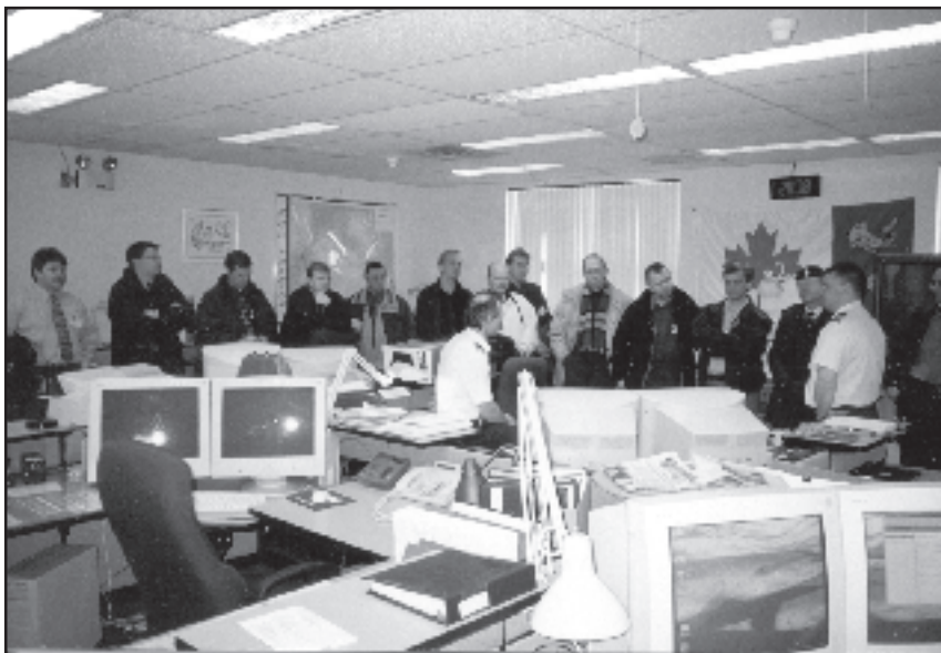
LEFT Workshop participants receive briefing.

The workshop's objectives were threefold: provide an overview of the Canadian Forces' response to a major air disaster, discuss the roles and expectations of the various stakeholders during an incident response, and identify conflicts and redundancies in the response and recommend planning changes to address these problem areas. Presentations made by staff from the Canadian Forces' included: