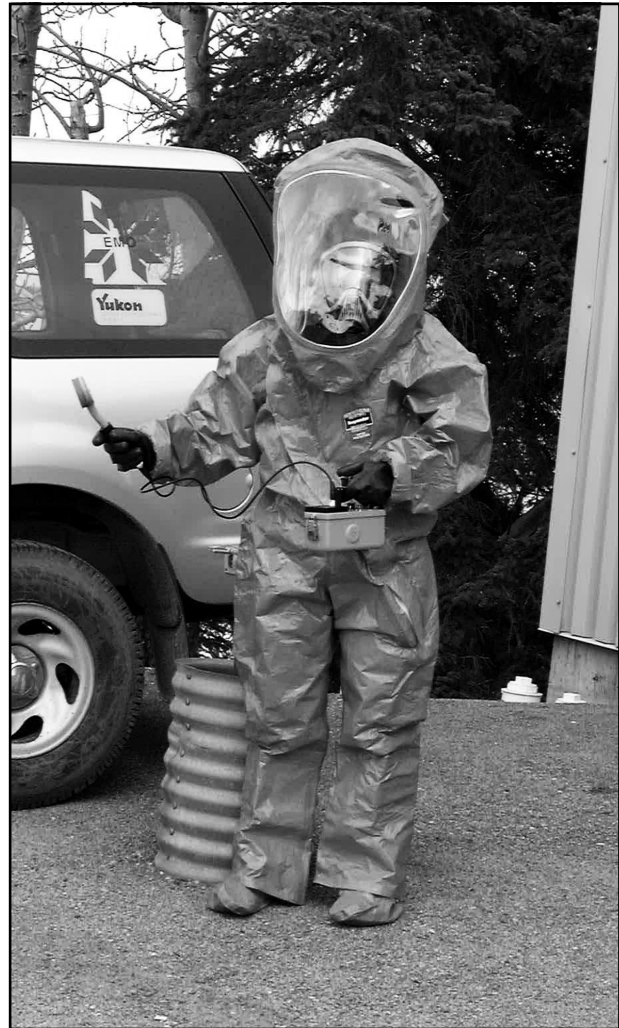
One of the CBRN suits acquired with JEPP support

EMO thanks the Office of Critical Infrastructure, Protection & Emergency Preparedness (OC�PEP), who administers the JEPP program, for their ongoing support of Yukon emergency planning initiatives.