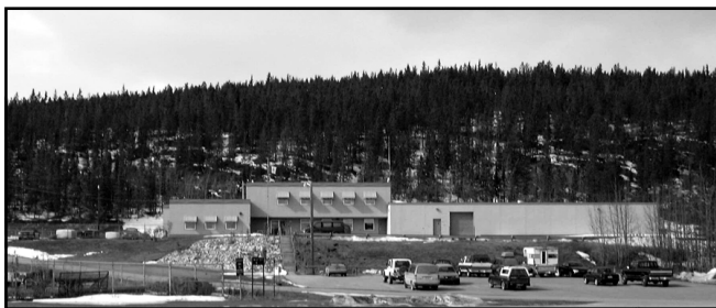
Headquarters of YTG Protective Services