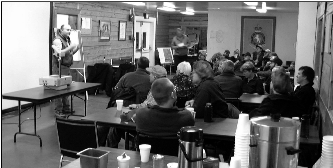
SAR members from around the Yukon congregated at the Cadet Camp in Whitehorse in October 2002 for an intensive weekend of training.