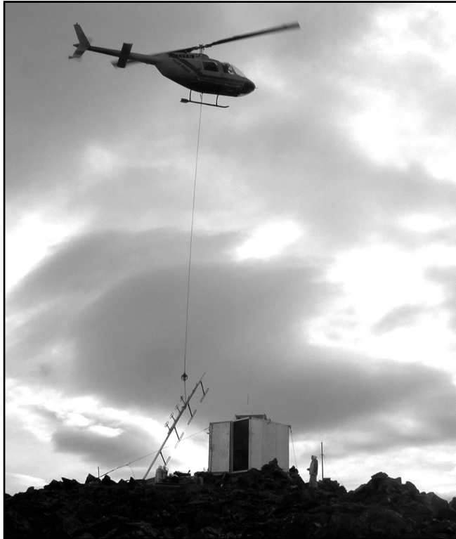
A Bell 206 helicopter airlifts YARA's antenna into position at the Mount Decoeli radio site in August 2002.

Yukon boaters are close to having a marine distress system activated for the southern Yukon. About two and a half years ago the Yukon Amateur Radio Association (YARA) was able to secure funds from the Coast Guard's National Search and Rescue Secretariat (NSS) to set-up this radio system in four of YARA's mountain-top radio sites.