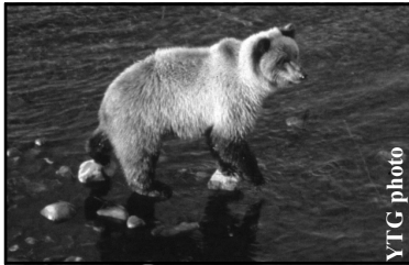
SAR weekend training in Haines Junction will include a bear awareness workshop.

personnel. Some participants will have little or no SAR experience, while others have many years of expertise in search and rescue.