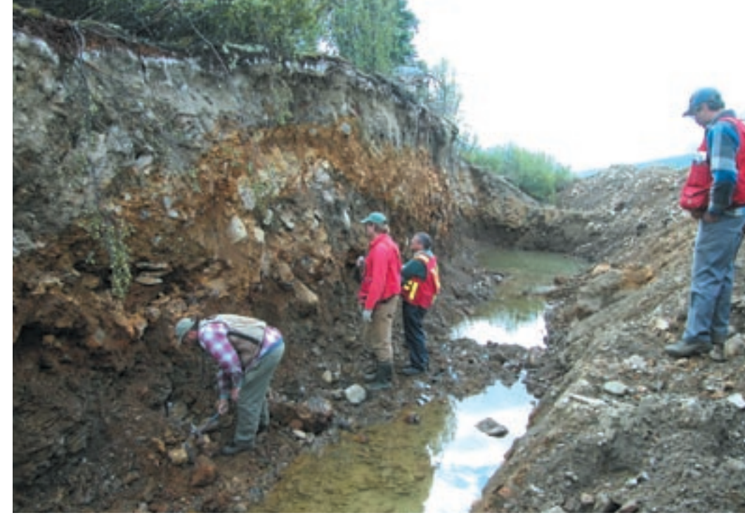
Examining gold mineralization in trenching at the Tay-LP property.

Fuel purchases in the Yukon are taxexempt for off-road exploration and mining activities. This includes gasoline, diesel and aviation fuels. There are no propane or heating taxes. Businesses can also apply for a refund on any fuel taxes, paid at the time of purchase, up to six years after the purchase date.