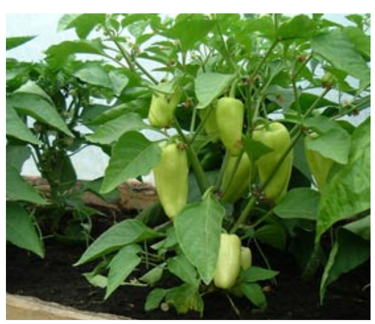
Peppers grown in the Little Salmon/Carmacks FN greenhouse

The deadline for receipt of proposals is 4:00 p.m. October 4, 2002.