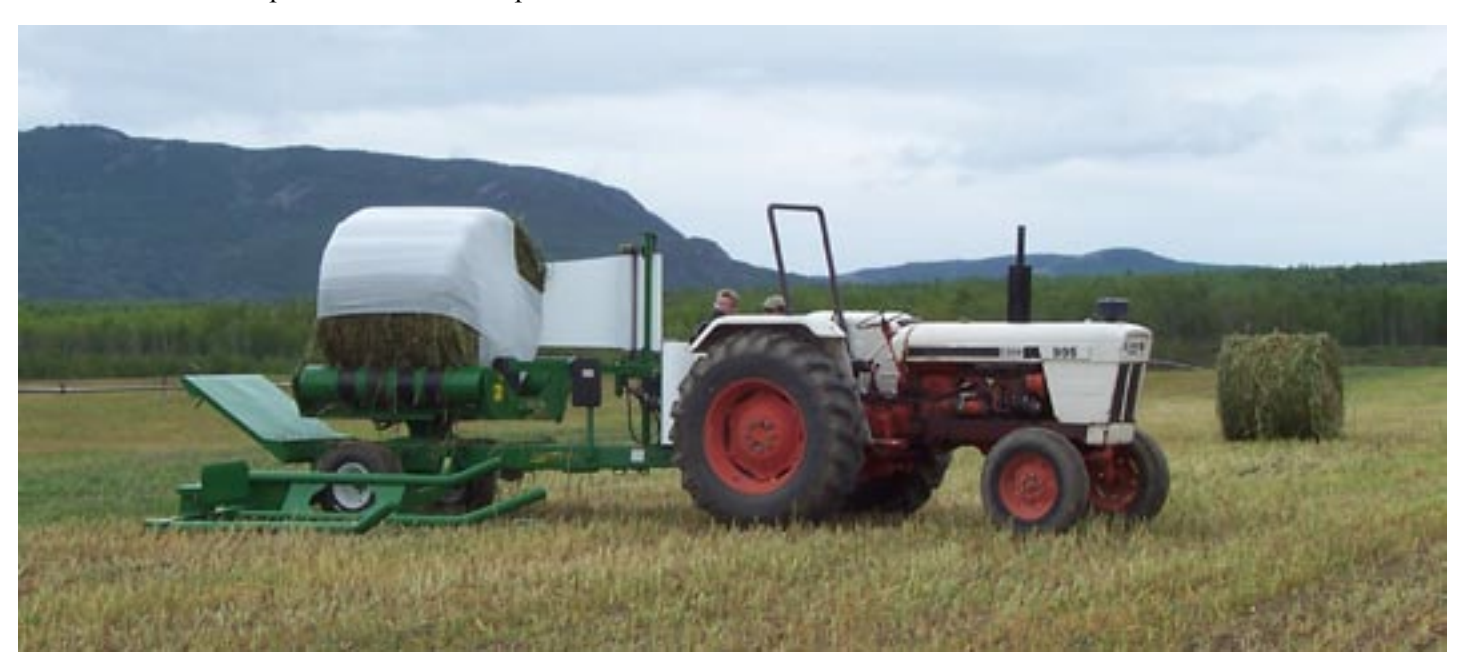
Bale wrapper purchased through assistance under the Renewal Program of APF