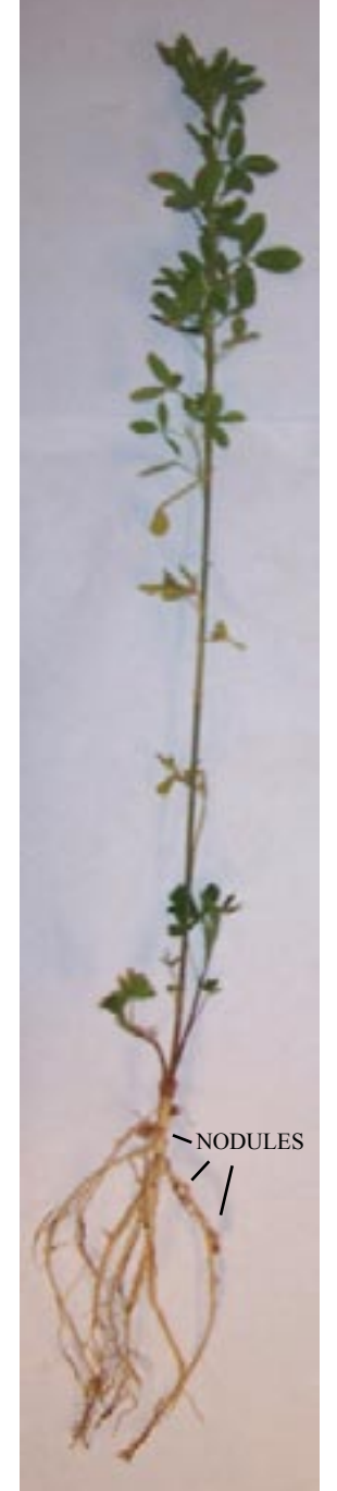
Legume (alfalfa) with nodules

sent back to the plant allowing the rhizobia to infect the plant root hairs. This leads to nodules on the roots of the legumes. These nodules can range in size, some over a centimeter, so they are easy to see. Dig up a legume very carefully and you might find nodules on the roots, split one open and you'll see the red colouring - this is the leghemoglobin - you are watching the rhizobia at work!