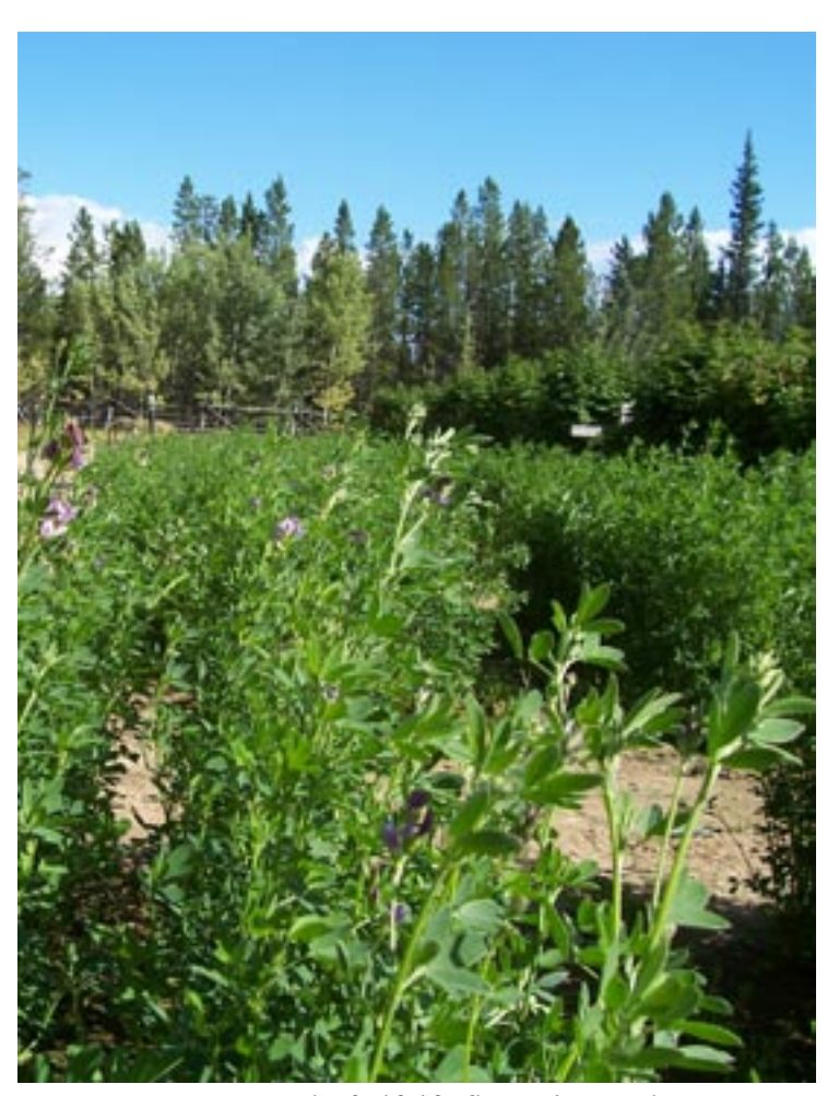
A new stand of alfalfa flowering at the Takhini Forestry Farm in 2005

- Adapted from Agri-News September 5, 2005