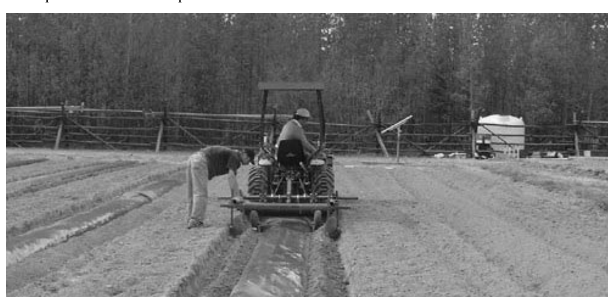
Making strawberry planting beds at the Takhini Forestry Farm in June 2002.

This study will be repeated during the 2003 growing season.