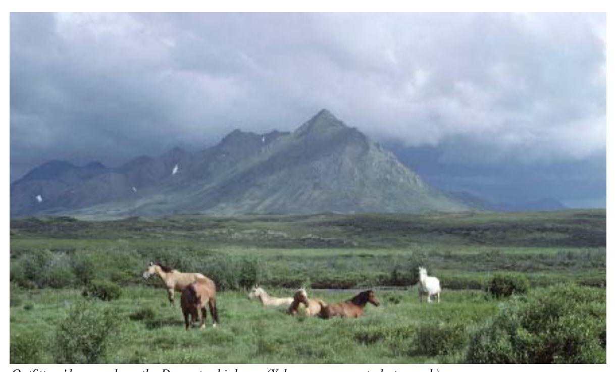
Outfitters' horses along the Dempster highway.

The Yukon Bureau of Statistics will conduct the survey sometime in December. All responses are strictly confidential and will be presented to the Agriculture branch in a manner that insures respondent anonymity. Results of the survey should be available for the spring newsletter.