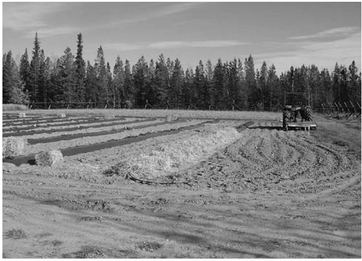
Spreading straw to prepare the strawberry trial for winter.