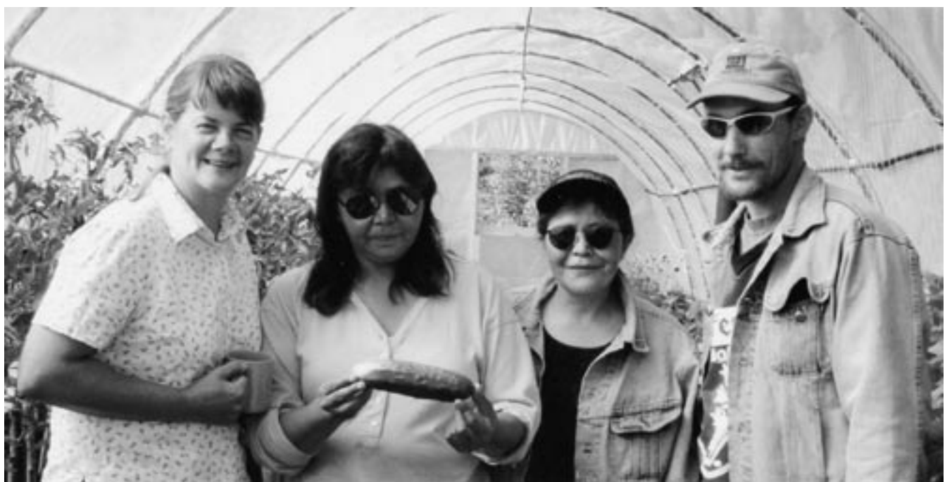
Greenhouse trial conducted by the Carmacks Little Salmon First Nation in 2002.

Those attending the meetings, suggested that the branch use this newsletter to keep them informed about the results from other meetings and to report progress on the development of programs under the APF. Results from these initial stakeholder meetings are not available at the time of printing for this issue, however, we encourage anyone who would like to contribute suggestions or learn more about the Agriculture Policy Framework Agreement to contact us at the Agriculture branch. The next newsletter and APF update, is scheduled for mid-March.