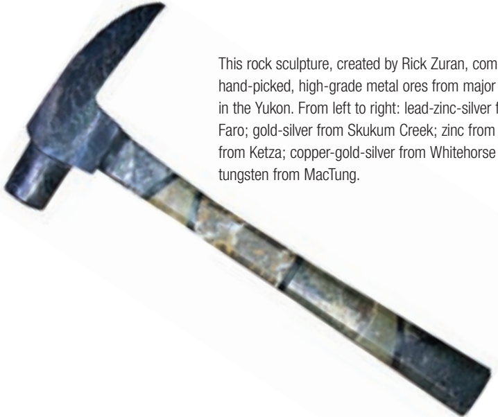
This rock sculpture, created by Rick Zuran, comprises hand-picked, high-grade metal ores from major deposits in the Yukon. From left to right: lead-zinc-silver from Faro; gold-silver from Skukum Creek; zinc from Goz; gold from Ketza; copper-gold-silver from Whitehorse Copper; tungsten from MacTung.

was first recognized with the discovery of the Kudz Ze Kayah deposit in 1994 (11.1 million tonnes of 5.9 per cent zinc, 1.6 per cent lead, 0.9 per cent copper, 1.37 grams/tonne silver, 1.33 grams/tonne gold). Since then, the Wolverine (3.75 million tonnes of 12.5 per cent zinc, 1.4 per cent lead, 1.4 per cent copper, 336.6 grams/tonne silver, 1.6 grams/tonne gold) and other deposits have been discovered. These include Ice (4.5 million tonnes of 1.48 per cent copper), Fyre Lake (8.2 million tonnes of 2.1 per cent copper, 0.11 per cent cobalt, 0.73 grams/tonne gold) and GP4F (1.5 million tonnes of 6.4 per cent zinc, 3.10 per cent lead, 0.10 per cent copper, 90 grams/tonne silver and 2.0 grams/tonne gold). Recent geological mapping in this district by the Yukon Geological Survey has shown that there are at least four discrete packages of felsic and mafic volcanic rocks with the potential to host