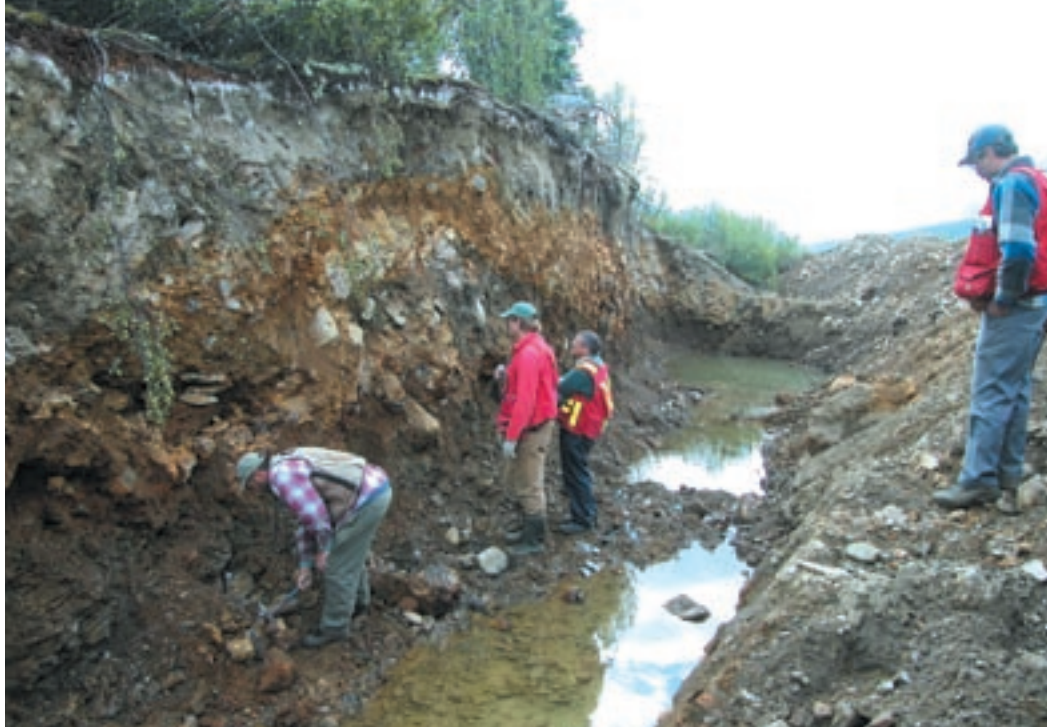
Examining gold mineralization in trenching at the Tay-LP property.

Fuel purchases in the Yukon are tax-exempt for off-road exploration and mining activities. This includes gasoline, diesel and aviation fuels. There are no propane or heating taxes. Businesses can also apply for a refund on any fuel taxes, paid at the time of purchase, up to six years after the purchase date.