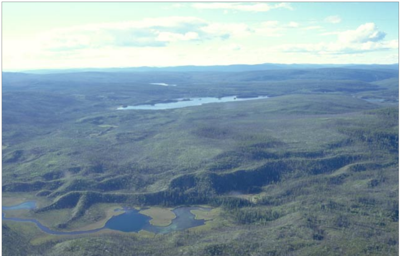
Figure 182-1. The Crow Plateau within the Hyland Highland Ecoregion was glaciated from the west (left to right) creating a gently rolling landscape. Elongated sandy and gravelly landforms include eskers several kilometres long. Numerous small lakes are frequented by Trumpeter Swans in summer. The extensive upland forests provide good habitat for species such as Pine Marten.