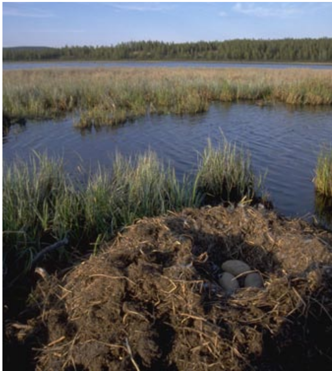
C.D. Eckert, Yukon Government

Significant numbers of Trumpeter Swans breed in the Toobally Lakes area, along with numerous dabbling and diving ducks (CWS, Birds of the Yukon Database). The north end of North Toobally Lake serves as a spring staging area for Trumpeter Swan and ducks (Dennington, 1985), while the outlet of South Toobally Lake is important in both spring and fall as a staging area (Dennington, 1986a). Other important wetlands include Larsen Lake and the upper Whitefish River (Fig. 182-8) (Dennington, 1985; McKelvey and Hawkings, 1990). Lee Lake, just west of the confluence of the Beaver River, and Larsen Creek, and the Beaver River Wetland, northwest of the confluence of the Beaver and Whitefish rivers, provide important breeding habitat for a variety of waterfowl as well as Pied-billed Grebe, American Coot, and Sora (Eckert et al. , in prep.). Songbirds associated with these wetlands include Western Wood-Pewee, Common Yellowthroat, Le Conte's and Swamp Sparrows, and Red-winged and Rusty Blackbirds (Eckert et al. , in prep.). Lee Lake is one of only two Yukon locations where Marsh Wren has been documented (Eckert et al. , in prep.).