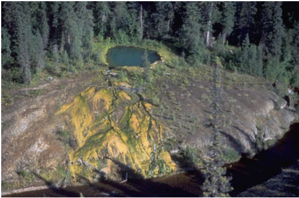
Figure 182-6. Hot springs in this ecoregion occur along deep-seated faults. Yukon occurrences of vascular plants, such as beggarticks ( Bidens cernua ; inset), Indian paintbrush ( Castilleja miniata ) and poison ivy ( Toxicodendron rydbergii ) are known in the Yukon almost exclusively from these springs.