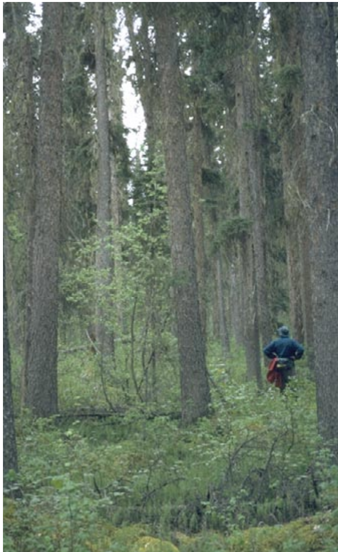
C.D. Eckert, Yukon Government

Labrador tea and alpine blueberry are common with a range of mosses, which reflect the moisture and nutrient status of the site. Black spruce bogs are usually associated with permafrost and Cryosol soils. Larch may be present on nutrient-rich sites. Black spruce is also the climax tree species on upland moraine or glaciofluvial deposits. Feathermoss and ground shrubs such as lingonberry, shrub birch, Labrador tea and crowberry usually dominate the understory. On drier sites, lichens can have prominent cover. On these nutrient-poor sites, lodgepole pine is often present, as it is usually the first conifer to colonize the drier sites after fire. It provides the cover for black spruce to establish in the understory and