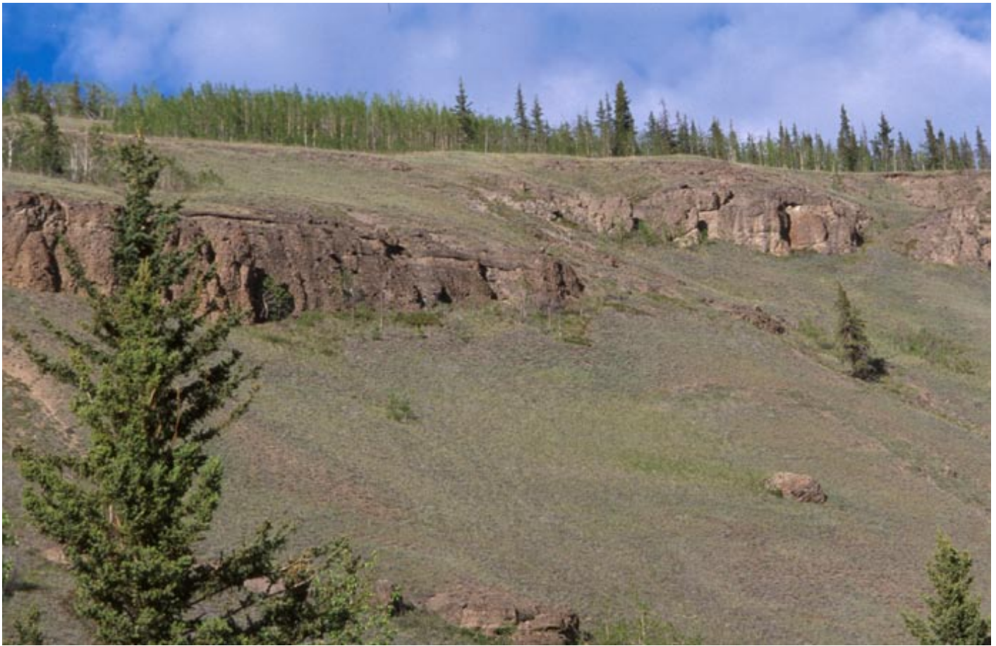
J. Meikle, Yukon Government

Figure 175-2. South- and west-facing slopes are very dry, with grasses and sage colonizing the alkaline soil (Melanic Brunisols). Bluffs of reddish conglomerate are of the Cretaceous Tantalus Formation.