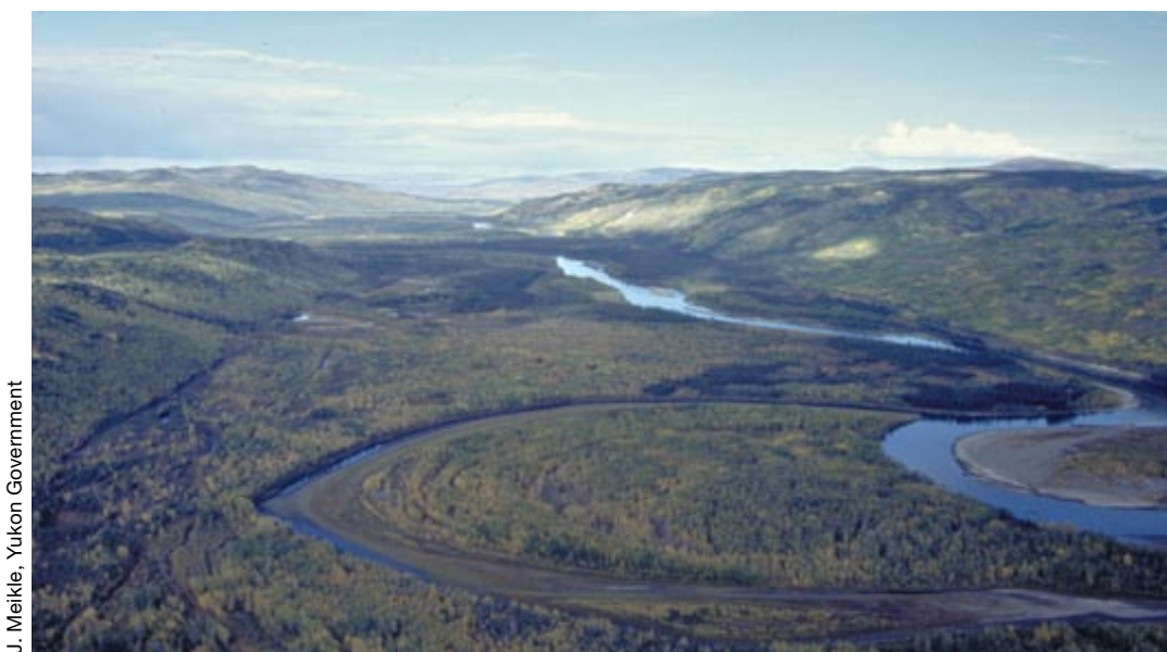
Figure 175-5. The valley of the Pelly River occupies the Tintina Trench through much of its course in the Yukon Plateau–Central Ecoregion. Note the wide floodplain and meander scars in the foreground. Dark patches of spruce represent older stands that have escaped recent fire.

The Yukon Plateau–Central Ecoregion spans both widespread and sporadic discontinuous permafrost zones. A large portion of the ecoregion lies west of the limits of McConnell glaciation, so the surficial deposits are coarse and dry, and largely free of ground ice. However, fine-grained and moist sediments in valleys are prone to perennial freezing and occurrence of ground ice. Permafrost was recorded in two of three instrument holes at Rink Rapids, north of Carmacks, with a maximum thickness greater than 18.3 m, and temperatures at 9 m ranging between -0.9 and 3.2^{\circ}\text{C} (Burgess et al. , 1982). The plateau surfaces in the ecoregion are too low to support alpine permafrost and most ice-rich ground is in valleys. In northern portions, permafrost is found in various terrain types, even in relatively dry till under deciduous forest near Pelly Crossing (Klohn Leonoff, 1988). Hughes (1969a) mapped many open-system pingos in the northern valleys, where surficial deposits permit downslope groundwater movement yet valley bottoms may be very cold in winter.