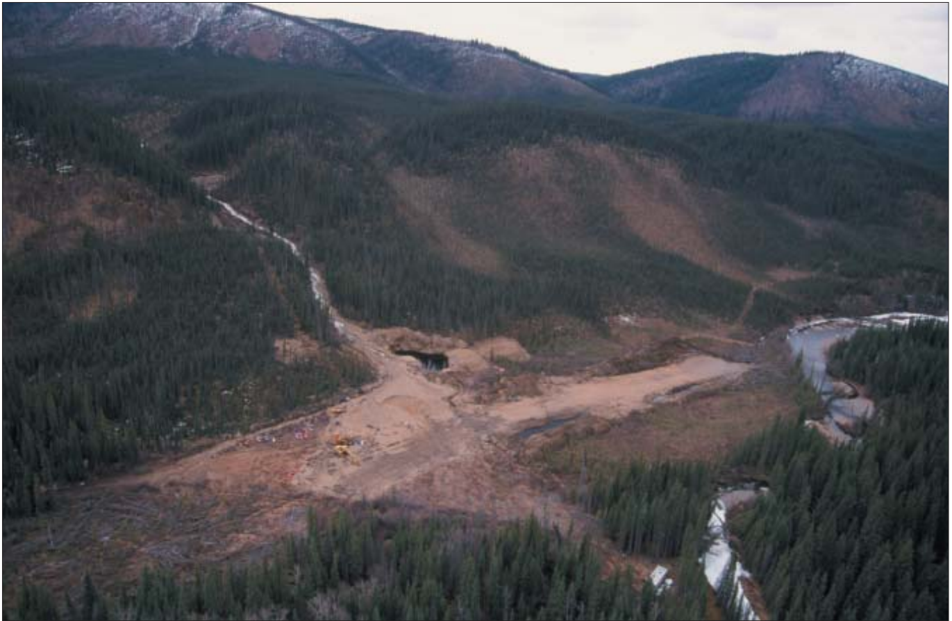
George Wilson's operation on Sonora Gulch.

COMMENTS The majority of work at this site has been in ground preparation for mining, moving materials, camp and equipment on-site. This is an extremely isolated site accessible by winter road or by air only. Mr. Wilson made a considerable effort to clean this site up from the garbage and materials left by previous miners.