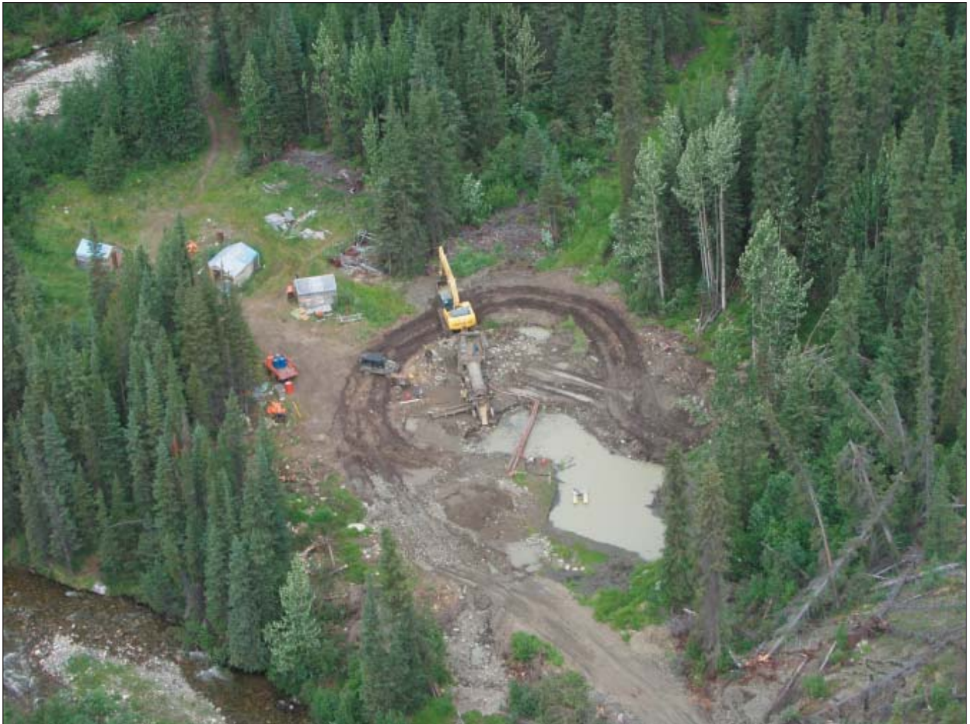
Operation on Iron Creek.

WATER SUPPLY AND TREATMENT A pump was used to supply trommel with water directly from Iron Creek. The effluent went back into the test pit and there was no evidence of a discharge.