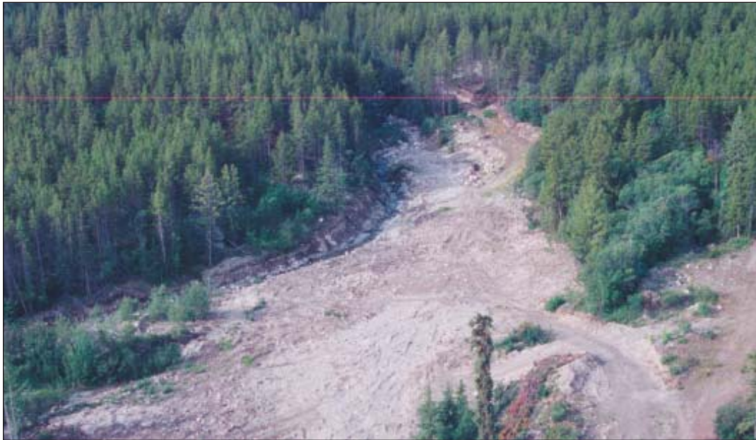
D. Hrehirchec and C. Cook operation on Wolverine Creek.

WATER SUPPLY AND TREATMENT A gravity feed ditch from Wolverine Creek fed a small reservoir. A pump with intake in the reservoir fed the processing plant. Effluent was treated in a small settling pond prior to flows returning to Wolverine Creek.