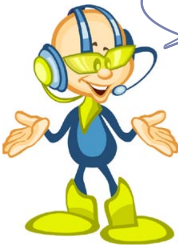
Figure it out... If you go back four generations to your great-great-grandparents, how many ancestors have you?

Genealogy is the study of a family's history — from children to parents, to grandparents, to great-grandparents to great-great-grandparents... and so on!