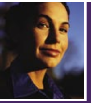
Investing in the future of Manitoba's communities