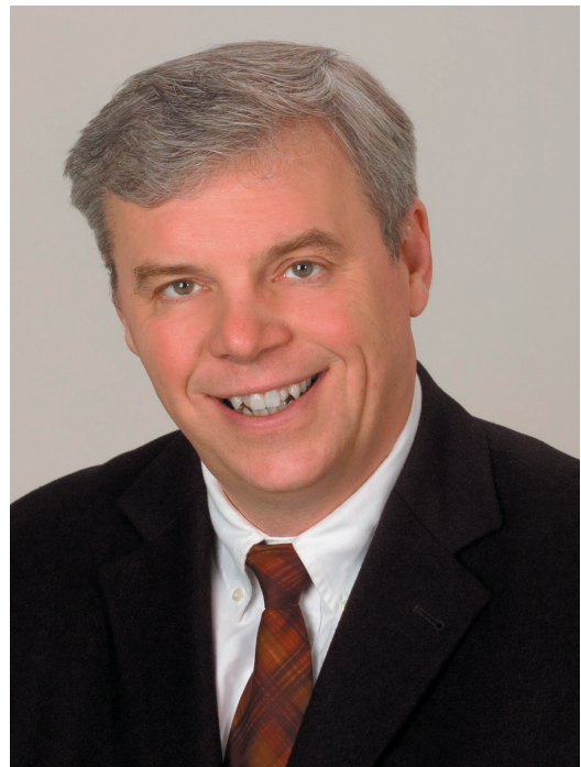
Honourable Greg Selinger Minister Finance

A handwritten signature in blue ink that reads "Greg Selinger".