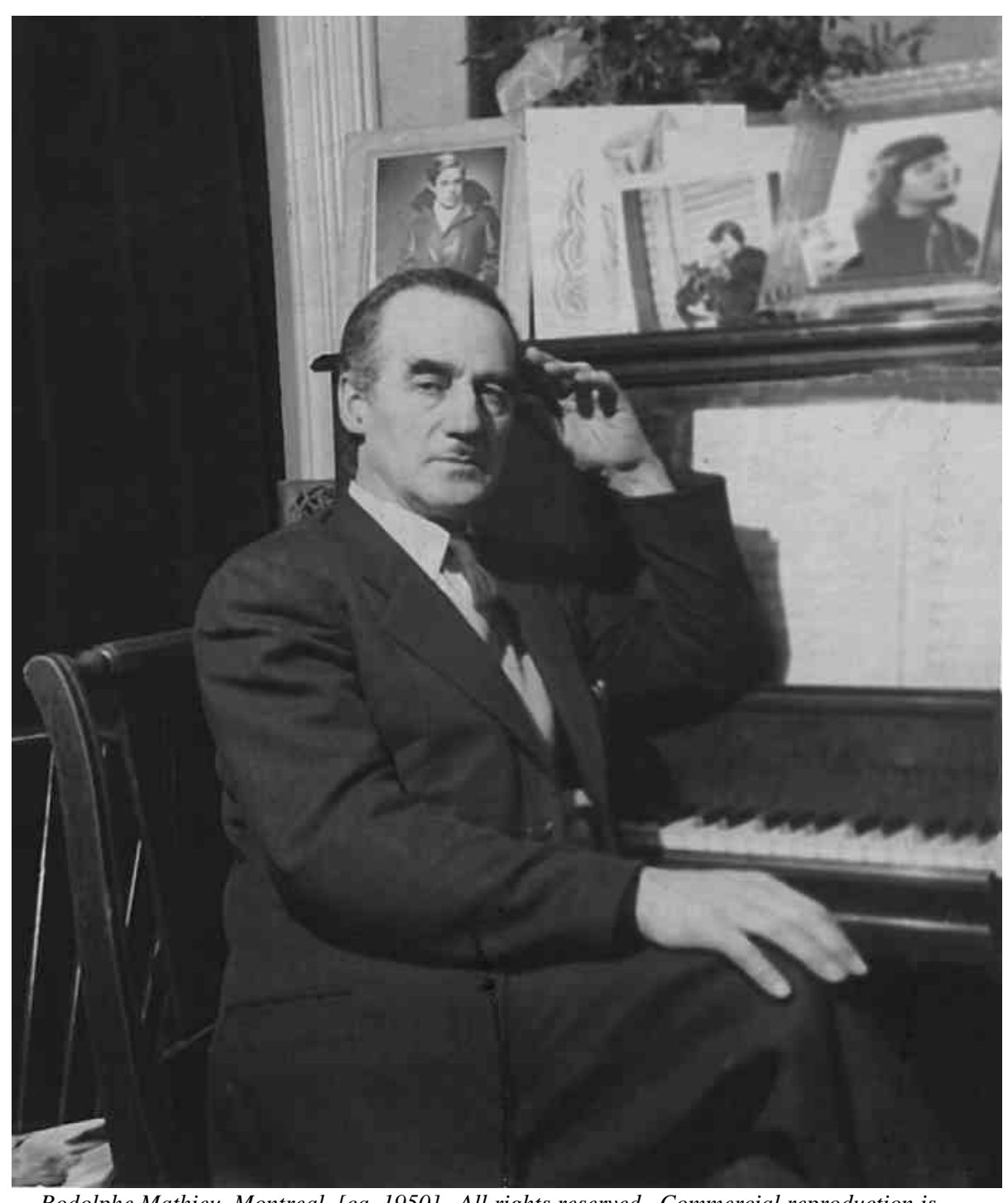
Rodolphe Mathieu, Montreal, [ca. 1950]. All rights reserved. Commercial reproduction is prohibited.