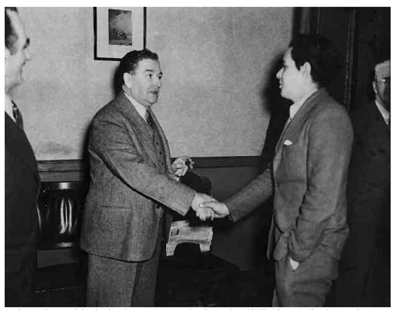
André Mathieu and the Quebec Premier Maurice Duplessis, [ca. 1946]. All rights reserved. Commercial reproduction is prohibited.

File containing mainly photographs of André Mathieu with family members and friends. The file also contains two photographs of André Mathieu with Maurice Duplessis.