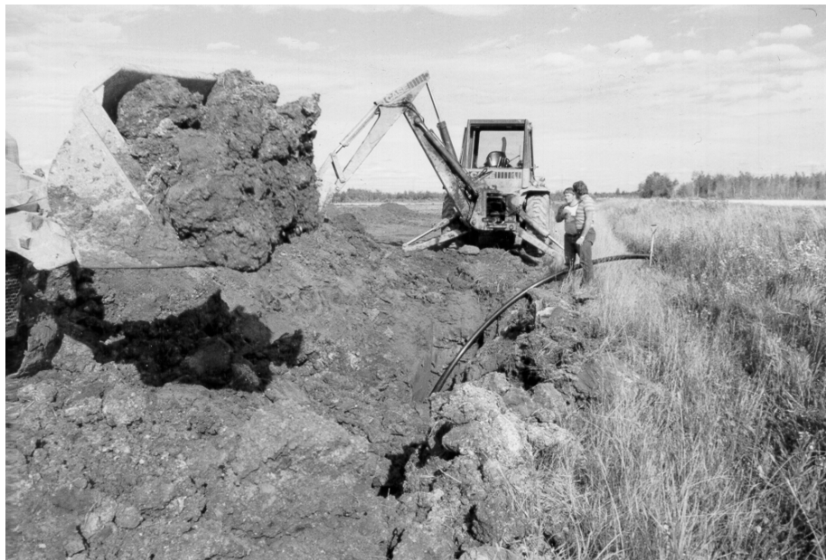
Farm pipeline installation.