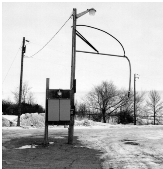
Typical community water supply.