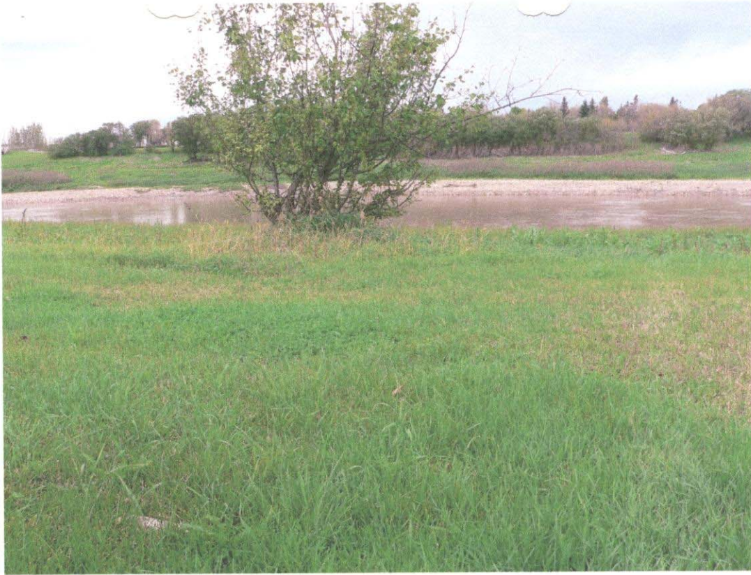
Section of damaged grass covered in weeds, facing west