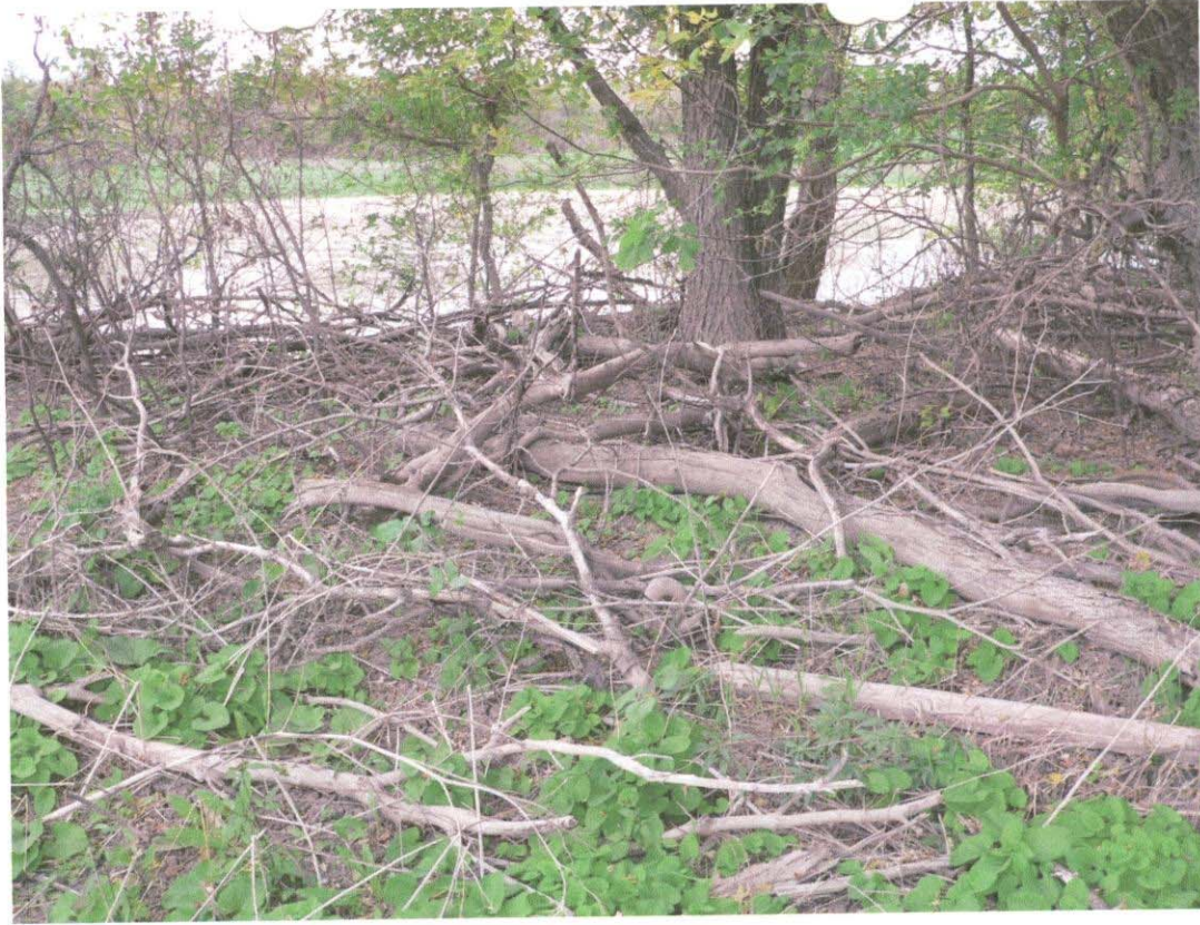
View of debris collected on property, facing west