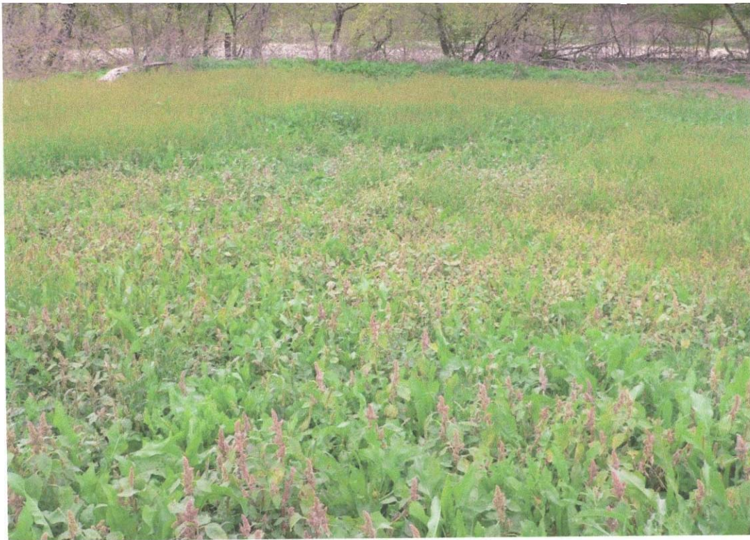
Section of damaged grass covered in weeds, facing west