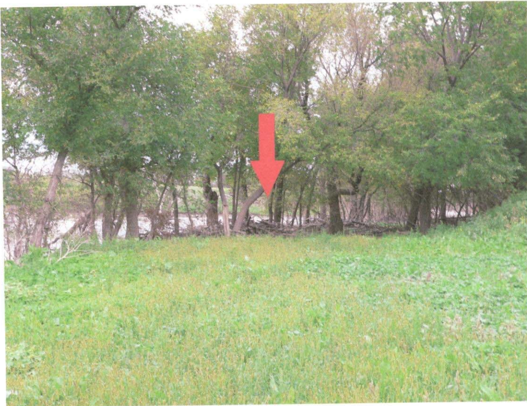
Arrow indicates debris collected on property, facing north