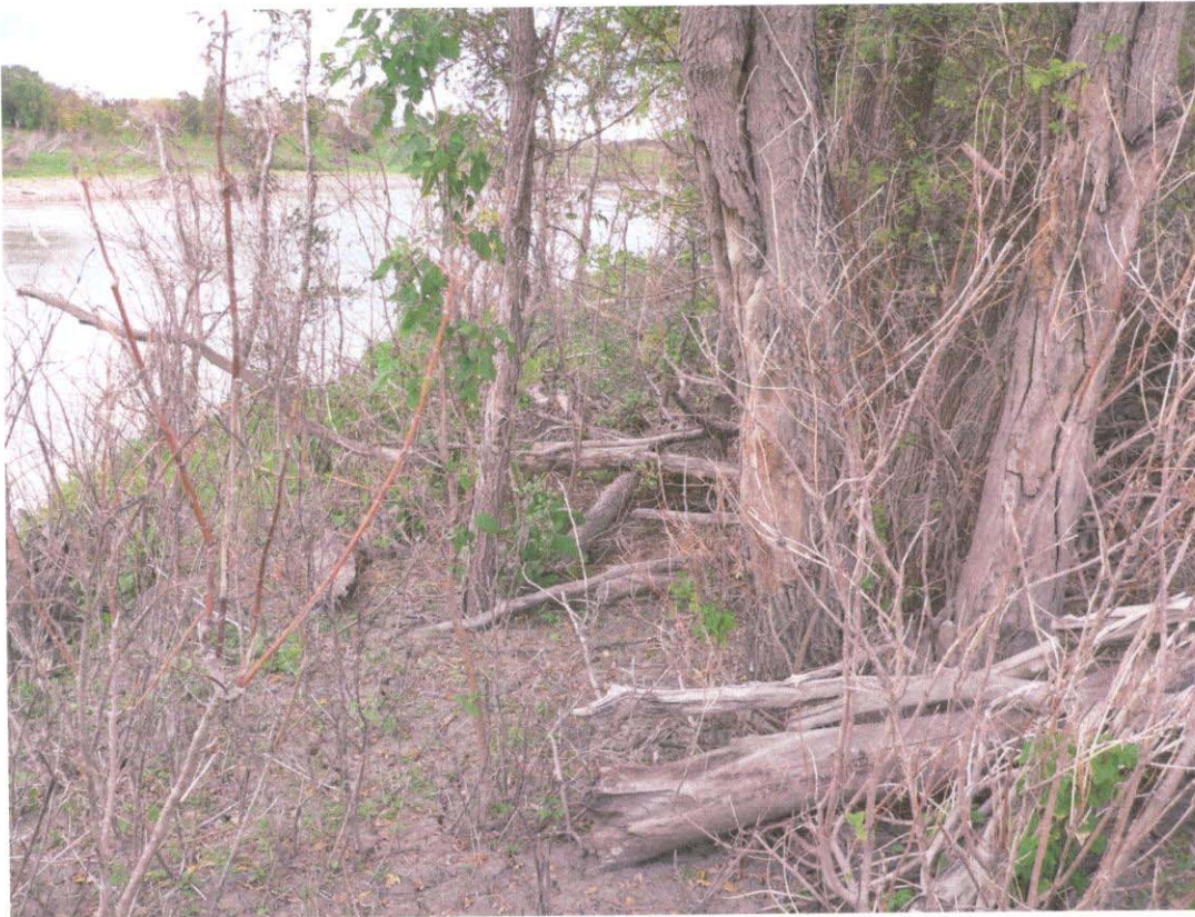
View of debris collected on property, facing north