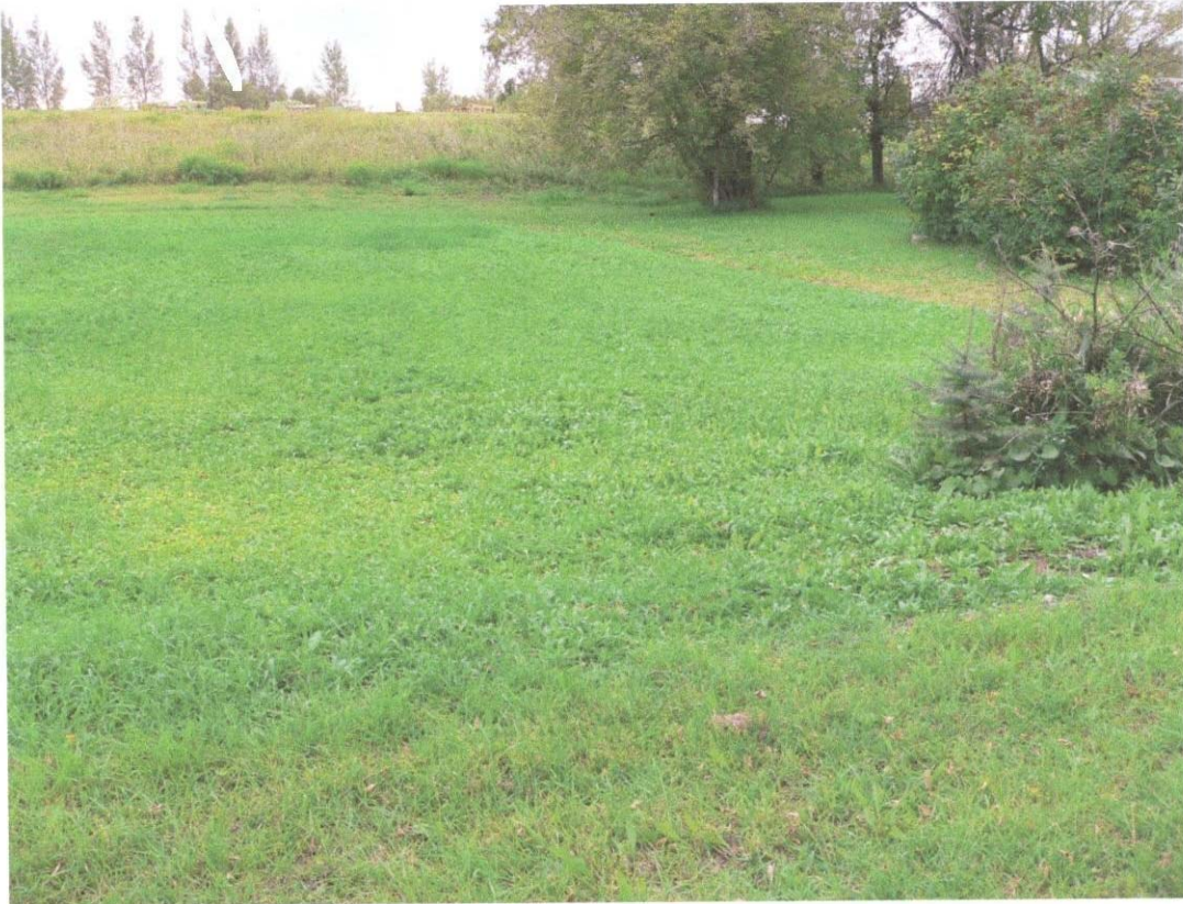
View of garden damaged by flood waters, facing east