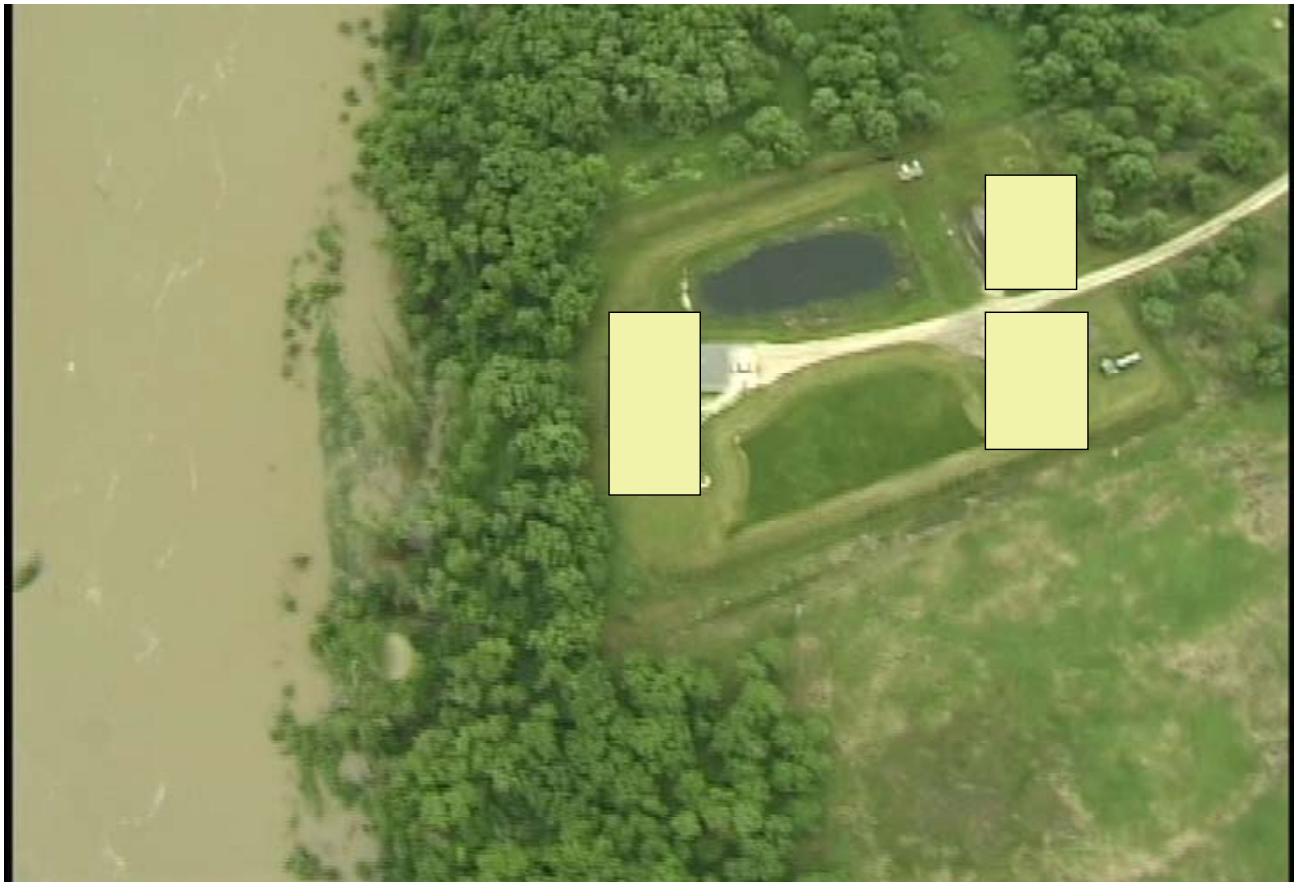
CLAIM #05-XXXX PHOTO TAKEN JUNE 13, 2005