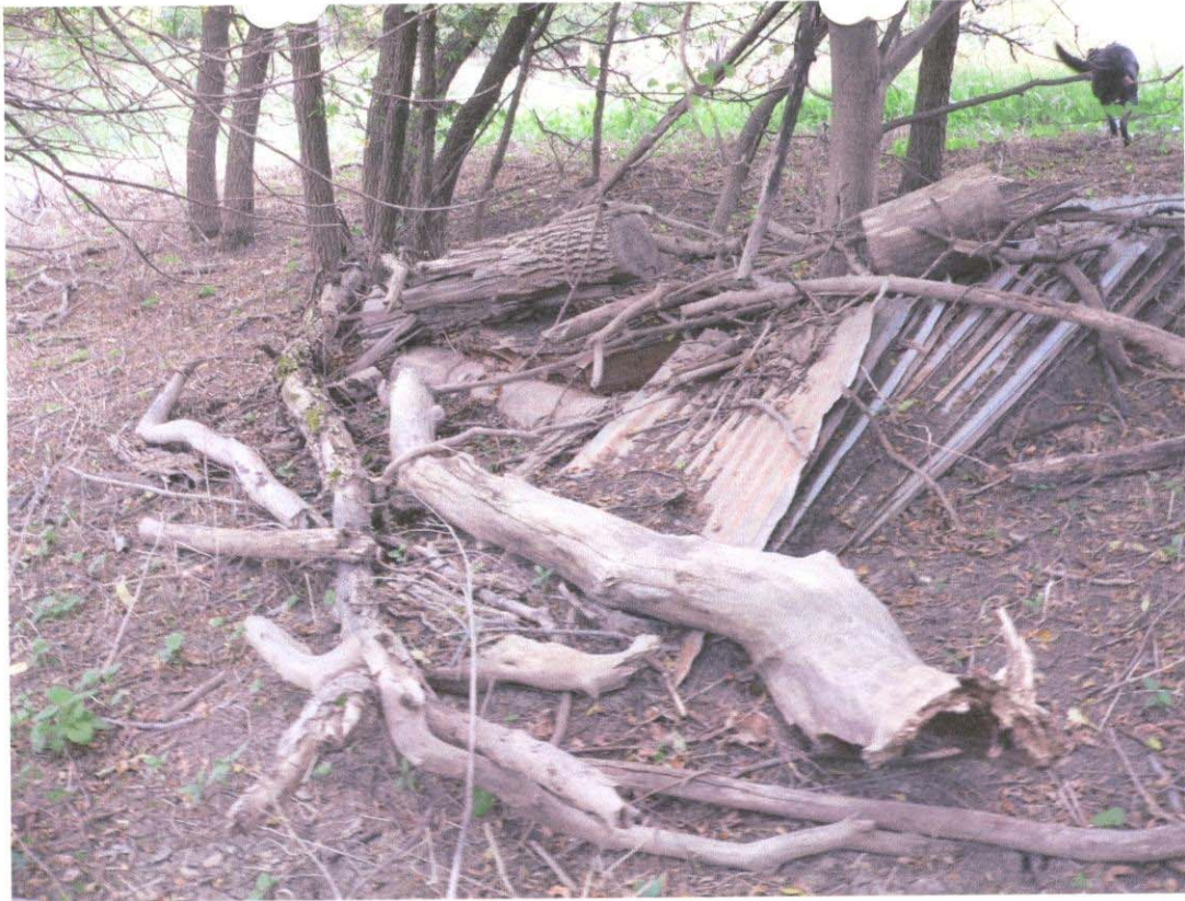
View of debris collected on property, facing west