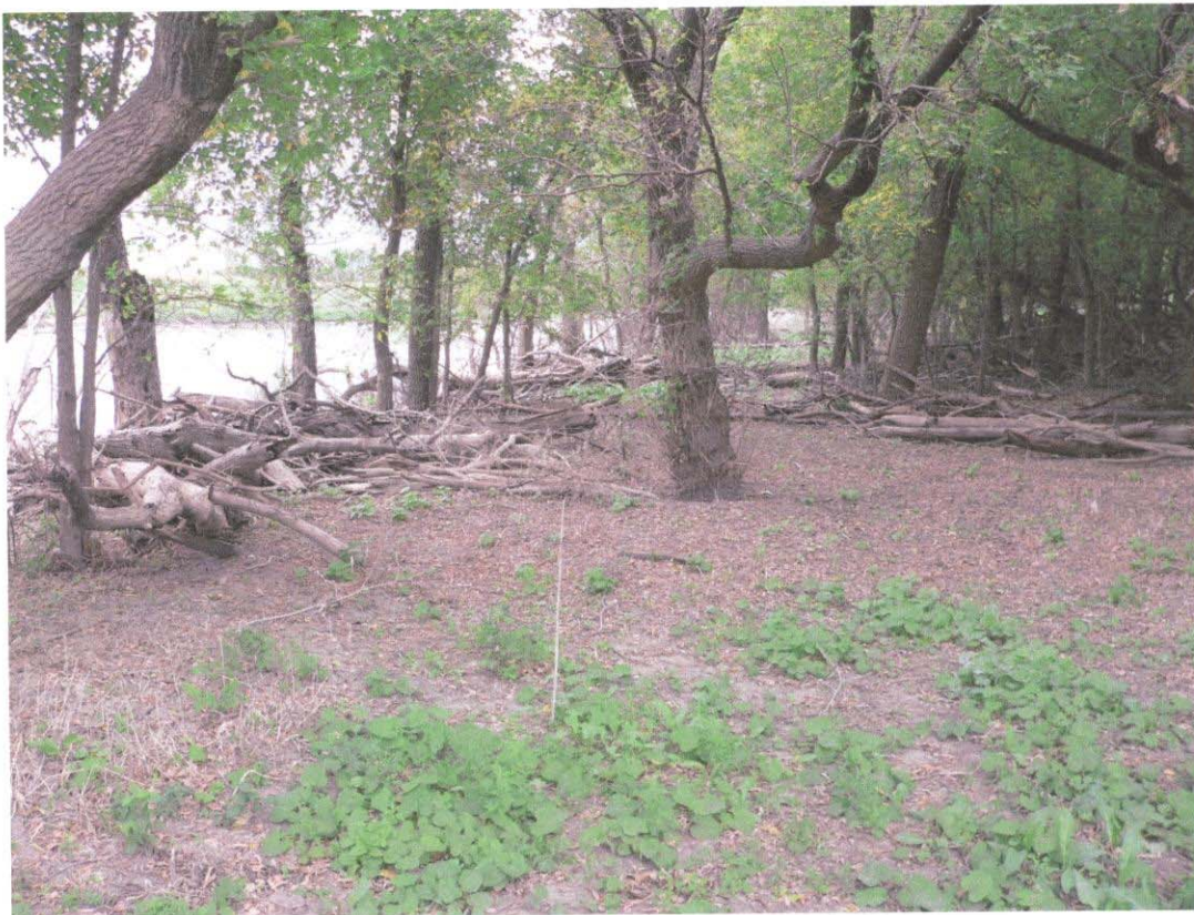
View of debris collected on property, facing north