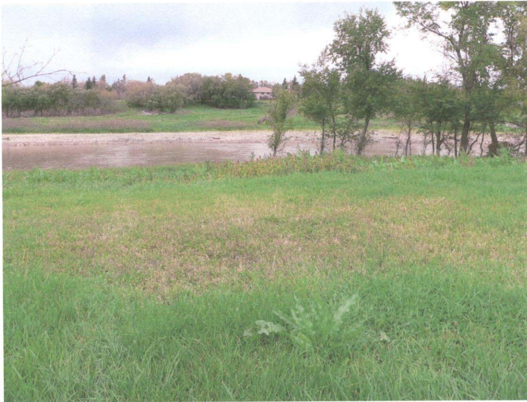
Section of damaged grass covered in weeds, facing west