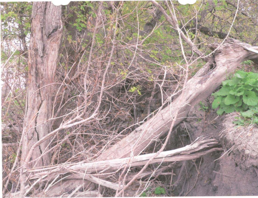
View of debris collected on property, facing north