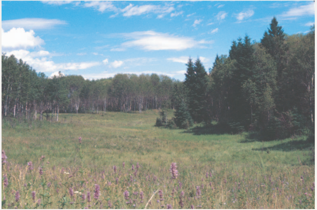
Is this cougar habitat?

The shooting of a cougar at Stead, 35 miles northeast of Winnipeg in 1973, and a detailed assessment of 281 documented sightings from 1879 to 1975 first established the species as resident in the province (Nero and Wrigley 1977). Subsequent department field surveys that failed to find evidence of resident