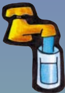
Timiginaktomi, obluk taman imaktknaktok.

Nigivaklotin nigiyominaktonin tamainin ublok taman. Koviagilogin inuinain nikaotain.