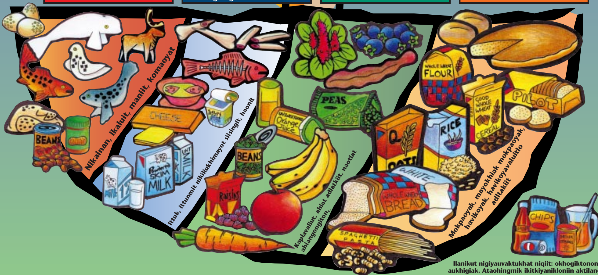
Nikainan, ikaluut, maniit, komaoyat