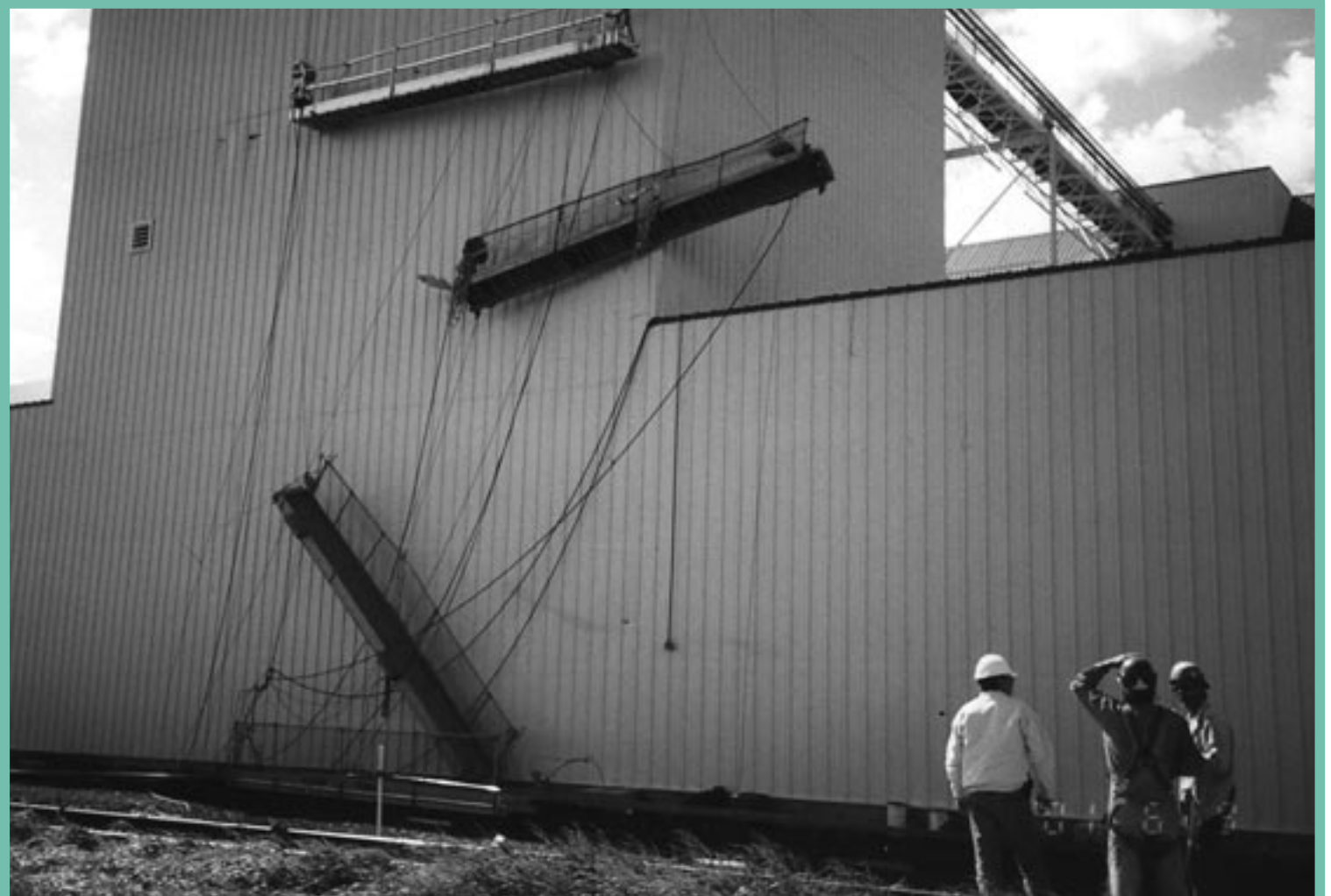
Safety-conscious crew averted a potentially disastrous situation and serious injury.

Unpredictable weather must always be considered a potential risk when working outdoors. In this incident, the preventative measures taken provided enough protection to save the workers. Maintaining adequate safety standards on the worksite, as this incident illustrates, requires the proper installation of equipment, the correct use of safety gear, alert supervision and quick response. Safety is never an accident, it is a planned action.