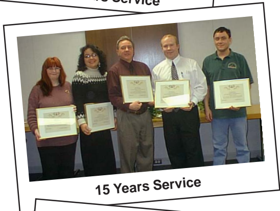
15 Years Service