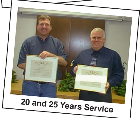
20 and 25 Years Service