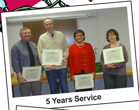
5 Years Service