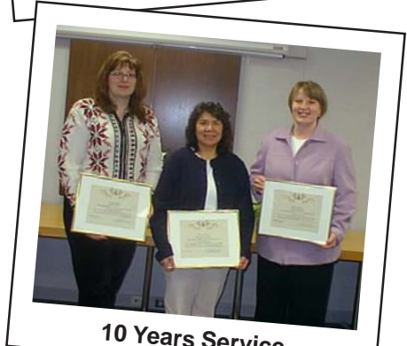
10 Years Service