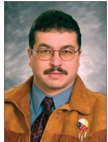
Honourable Michael McLeod Minister of Municipal and Community Affairs

This resource is a summary of the NWT Outstanding Volunteer Award recipients from 1991 to 2004. Their stories inspire and encourage all of us to follow the example of these outstanding individuals and groups.