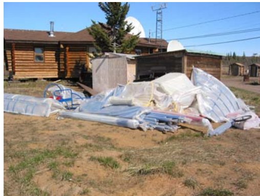
Equipment arrives to begin construction of a playground in Colville Lake.

The community of Colville Lake was approved for funding in order to construct a community playground. Work was initiated and playground equipment was received via winter road. The community has submitted an application for funding in 2004-2005 to complete construction of the playground project. This application has been approved.