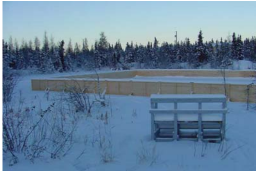
The completed Dettah outdoor skating rink is shown here.

The community of Dettah was approved for funding in order to construct an outdoor skating rink. The outdoor rink is to be used for various programs during the winter months. The construction was successful and this project is considered complete. The community intends to further develop the outdoor rink by painting lines and installing more lighting around the rink.