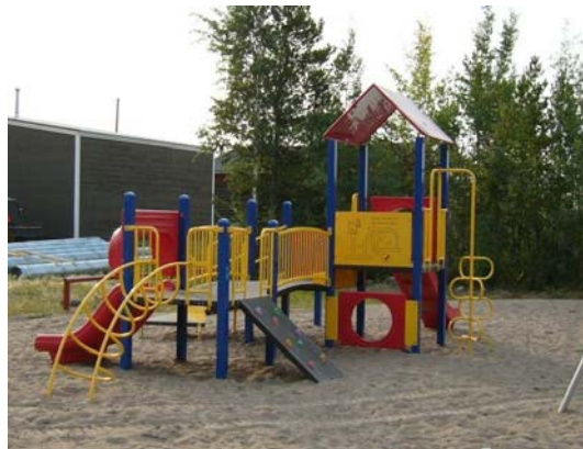
The Community Initiatives Program helped purchase equipment for the Trout Lake playground.

Trout Lake has been approved for funding in 2004-2005 in order to install more of the playground equipment.