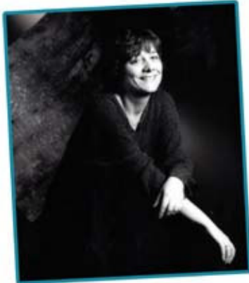
LEA POOL, WIDC 2007 Mentor Director

Providing an overview on the many aspects of being a director and feedback to the director participant.