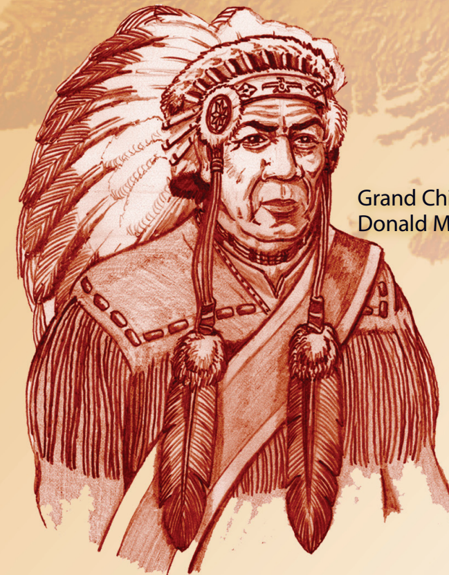
Grand Chief (1964 to 1991) Donald Marshall Sr.

Wampum Belts were used for protocol purposes of the Grand Council. It was the duty of a Grand Council member known as the Pu'tus—or Keeper of the Belt—to use the Belts as a journal of the discussions of previous meetings and missions.