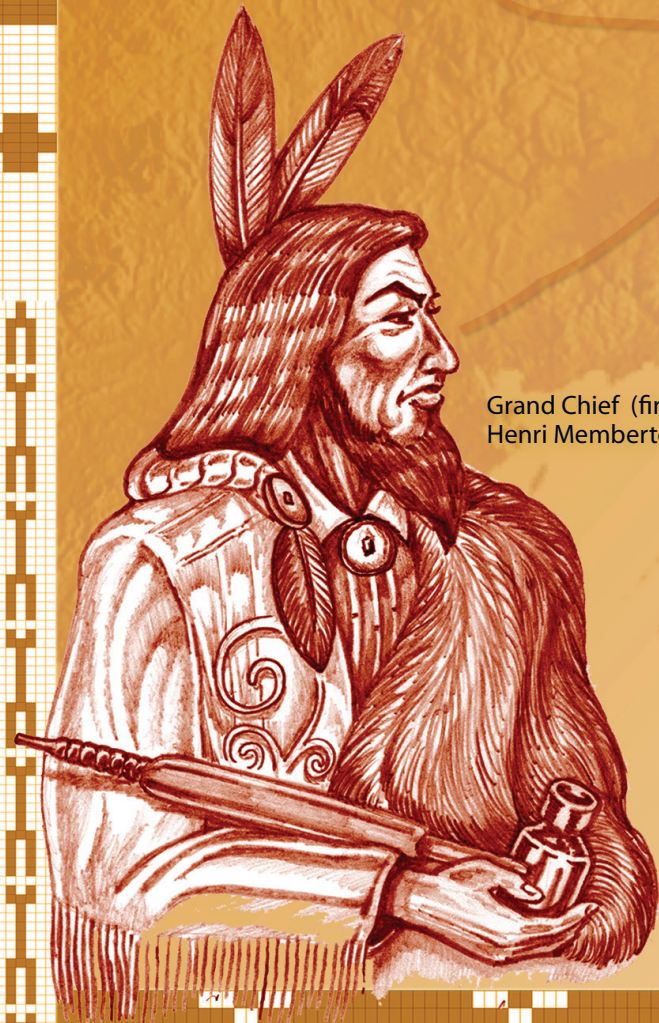
Grand Chief (first recorded to 1611) Henri Membertou

Wampum Belts were used for protocol purposes of the Grand Council. It was the duty of a Grand Council member known as the Pu'tus—or Keeper of the Belt—to use the Belts as a journal of the discussions of previous meetings and missions.