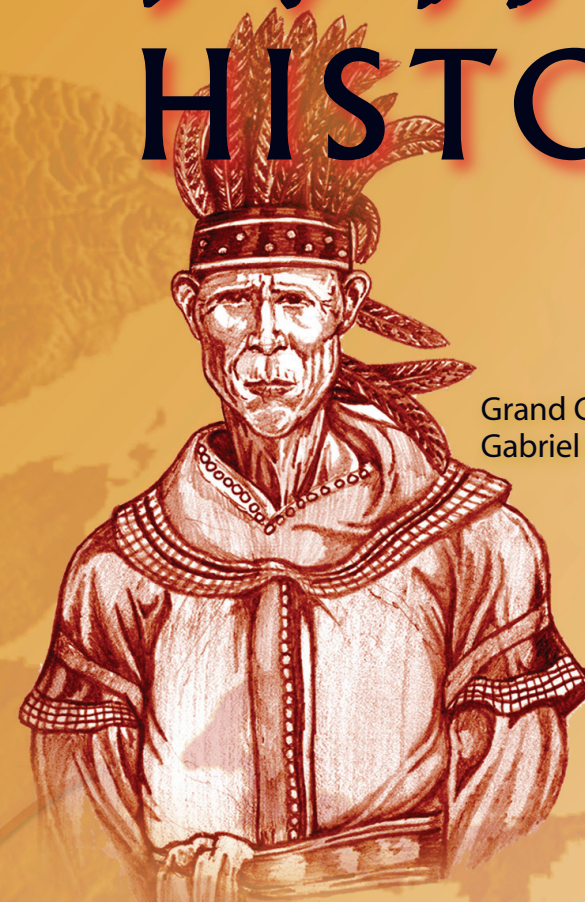
Grand Chief (1918 to 1964) Gabriel Sylliboy

The Mi'kmaq Grand Council is the traditional political structure of the peoples living in Mi'kma'ki. Each of the seven Districts of Mi'kma'ki has a District Chief who was elected from the tribal Chiefs from that District. One of the District Chiefs was appointed Grand Chief.