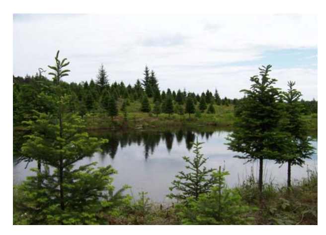
Photo: Fire pond on 2006 WOYA winner Tom Ernst's woodlot.