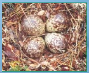
Greater Yellowlegs eggs

As the pace of human activity and landscape change has accelerated, opportunities to protect many of Nova Scotia's representative and special ecosystems, life forms, and features have diminished.