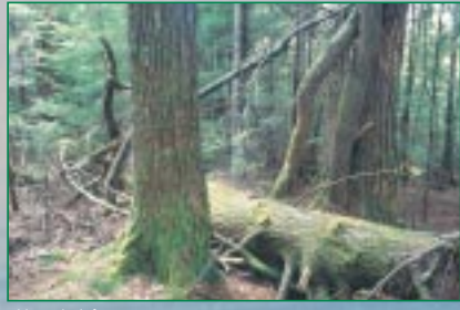
d Hemlock forest

In Nova Scotia, early efforts by a local IBP team of scientists identified 69 fragile, relatively undisturbed ecosystems. These ecosystems included old-growth forests, sand dunes, river floodplains, coastal islands, lakeshores, and estuaries. In 1981, the Special Places Protection Act was proclaimed, allowing for the designation of special "ecological sites" like those identified by the IBP committee. Since that time, seven nature reserves have been established in Nova Scotia under this legislation, including two on private land.