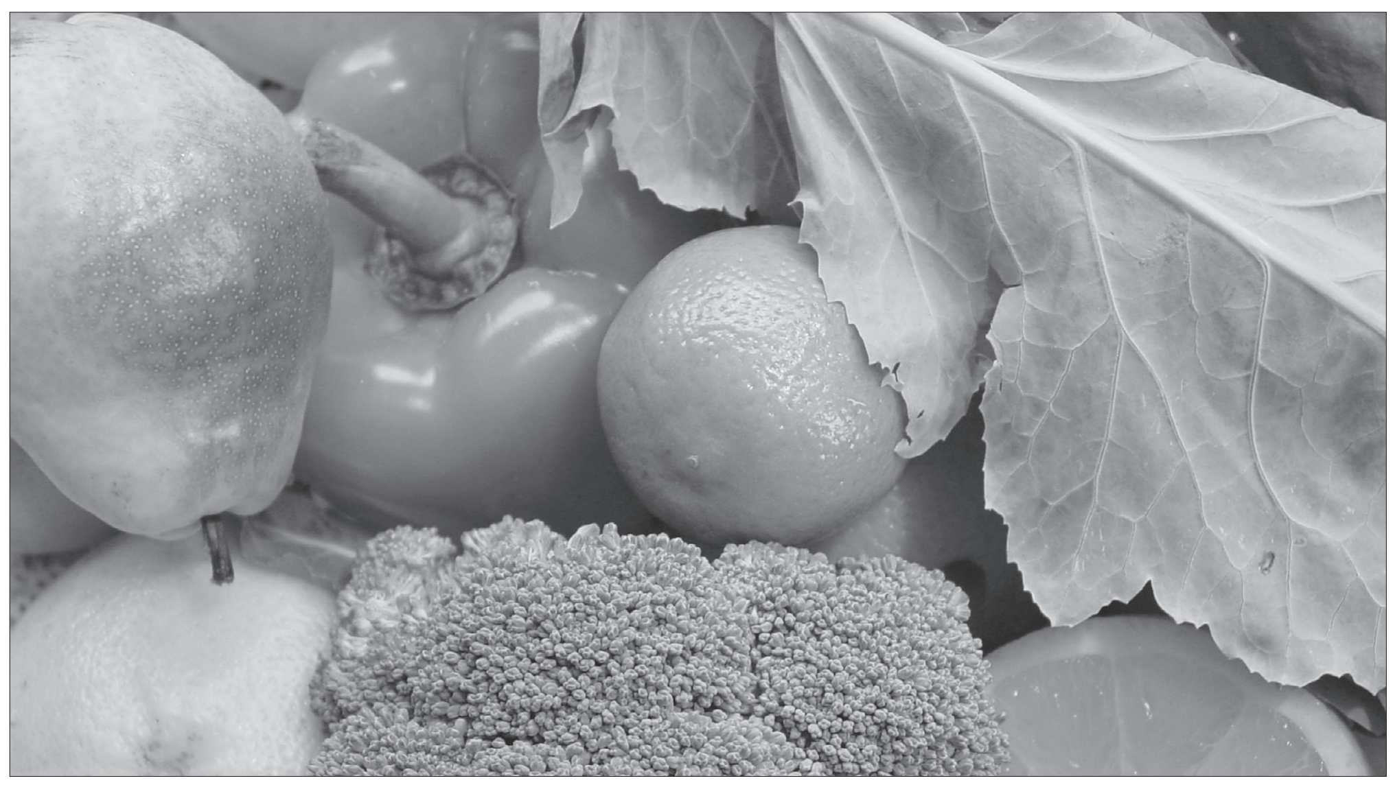
The most effective method of avoiding colorectal cancer is believed to be a healthy diet that is high in fibre, calcium, fruits and vegetables.