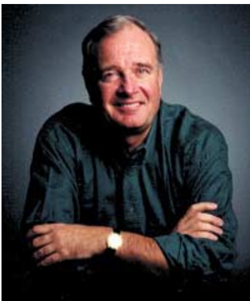
The Honourable Paul Martin, P.C., M.P.

As the federal department primarily responsible for the Government's finances and policies for economic development and growth, the Department of Finance directly supports the government's efforts to provide all Canadians and a better quality of life.