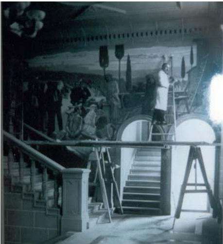
Artist Maurice Denis putting finishing touches to his mural “The Dignity of Work”

A broad staircase takes the visitor from the reception area to the first floor landing, which is decorated on both sides with large murals depicting various trades, crafts and professions. On the east side wall the French artist Maurice Denis painted “The dignity of work”.