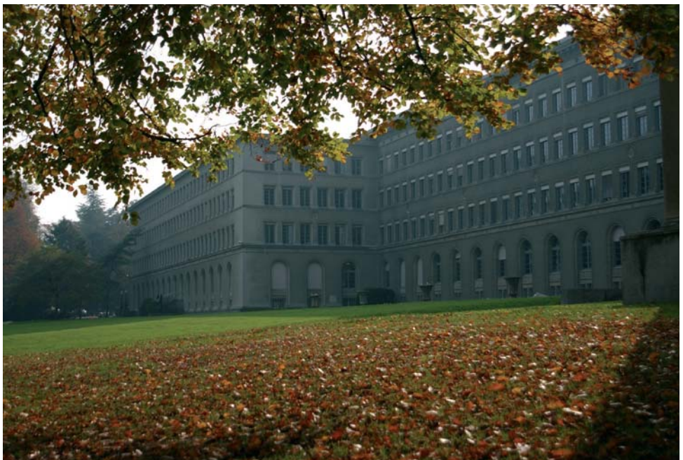
The Centre William Rappard, home of the WTO

The WTO receives thousands of visitors every year at the Centre William Rappard, including students, Ministers and trade officials from national governments who participate in meetings, Heads of State on official business, and members of the general public who are simply interested in visiting the home of the WTO. Our hope is that everyone will take away from this visit a better understanding of the WTO's role in the world, and a sense of the history of this building, which has been so closely linked to the development of co-operation and understanding between nations and peoples from around the world.