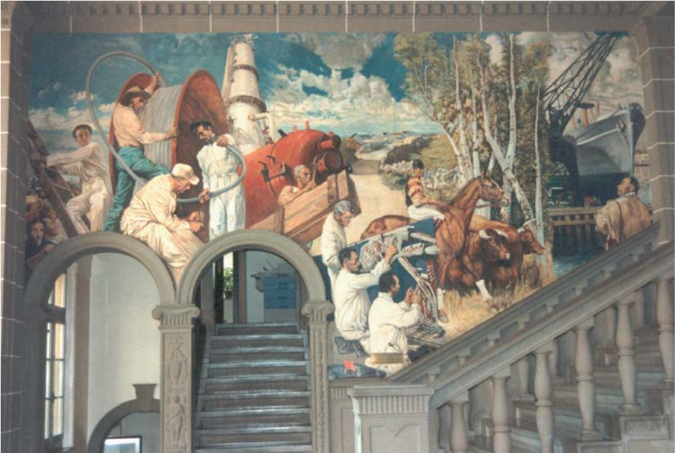
Mural on labour by artist Sean Keating

On the west side of the landing the Irish artist Sean Keating continued in his mural the theme of representing labour in all its forms.