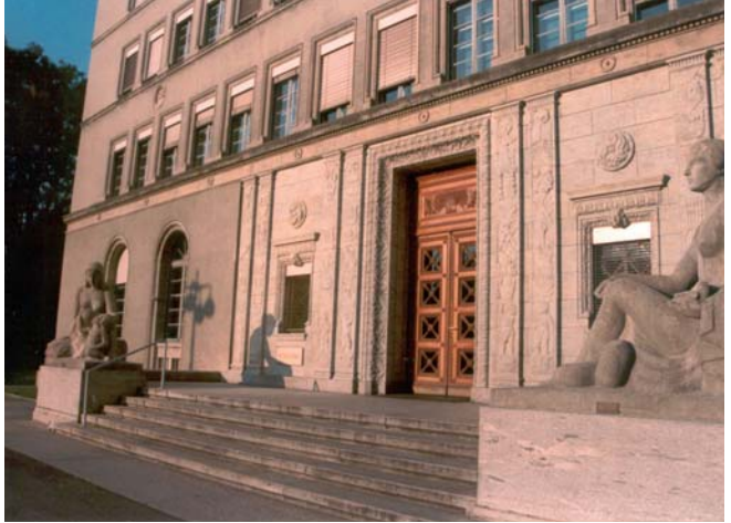
Depictions of “Peace” (right) and “Justice” (left) flank the main entrance to the home of the WTO