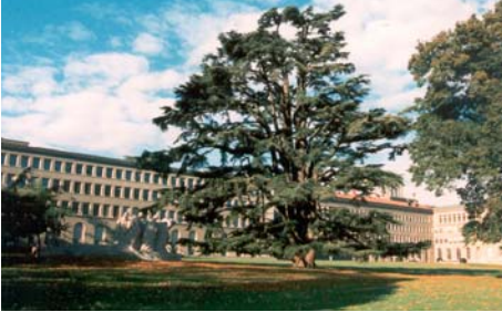
The William Rappard Park on the east side of the CWR

The William Rappard Park, situated between the Villa Barton and the Geneva Botanical Gardens, offers one of the most beautiful views of Lake Geneva and the Alps rising from the opposite shore. The park is equally remarkable for its gigantic twin cedars, well over a hundred