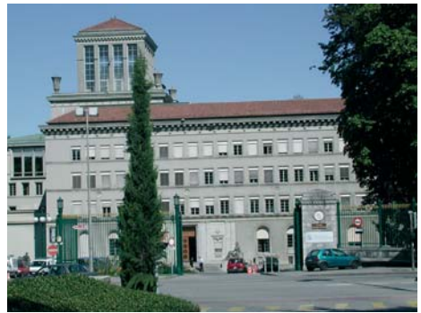
The entrance to the Centre William Rappard

At various points in its history, the building has been home to the International Labour Office, the United Nations High Commissioner for Refugees, the library of the Institut Universitaire de Hautes Études Internationales and the Secretariat of the General Agreement on Tariffs and Trade (GATT) which, prior to the creation of the WTO, had responsibility for the global trading system. Since 1995, it has been the headquarters of the WTO.