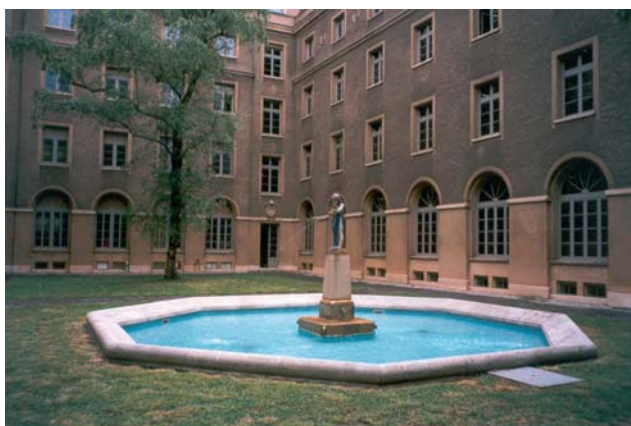
Interior courtyard of the CWR, in the Florentine style