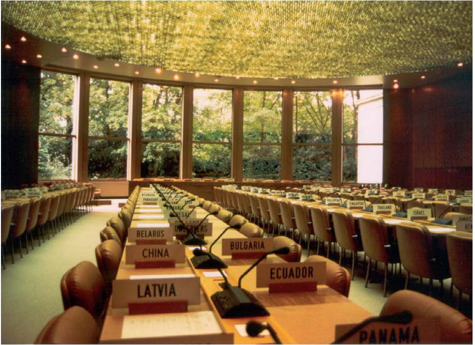
The Wyndham White meeting room, with designated seating for WTO Members

Every day trade diplomats and the WTO Secretariat staff congregate in the Centre William Rappard to discuss trade policy, negotiate rules and seek to resolve disputes that are linked to the trade agreements which constitute the body of international trade law developed since 1947. There are 21 meeting rooms in the CWR and the adjacent conference center, with a capacity to accommodate gatherings ranging from 580 to 12 participants.