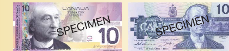
© Bank of Canada / Banque du Canada

All bank notes in the Canadian Journey and the Birds of Canada series contain the following anti-counterfeiting features: