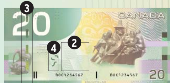
Image of the back of the note when not held to the light