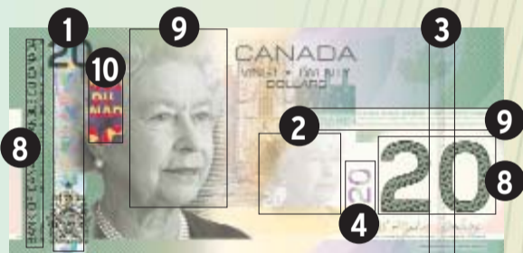
Image of the note when held to the light showing features 2, 3, and 4