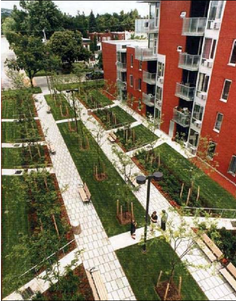
BENNY FARM MONTREAL