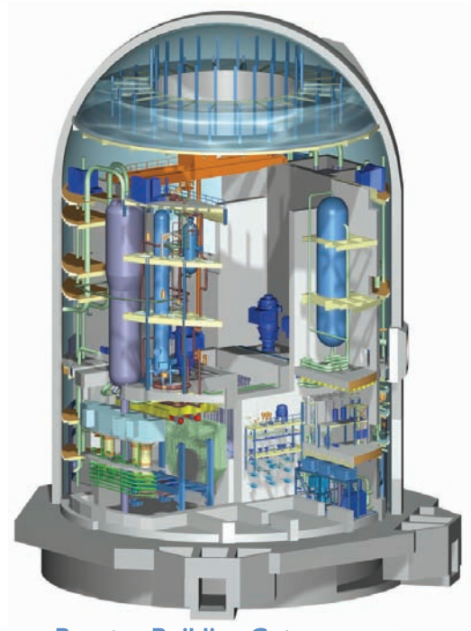
Reactor Building Cutaway

AECL is developing the Advanced CANDU Reactor (ACR-1000®), the next-generation CANDU nuclear power plant that represents an evolution of the best CANDU features and incorporates up-to-date passive safety, modular design, and advanced construction techniques. ACR-1000 is a 1200 MWe class reactor that is more economic than other forms of energy production and represents state-of the-art in