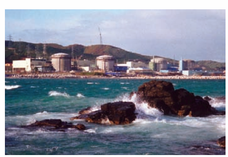
Wolsong, Korea, Units 2, 3 & 4